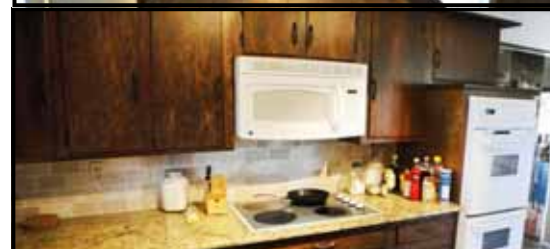
Granite Countertops & Double Ovens