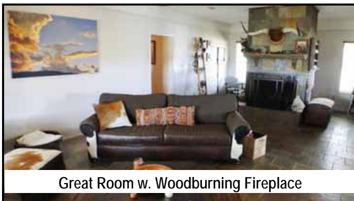
Great Room w. Woodburning Fireplace