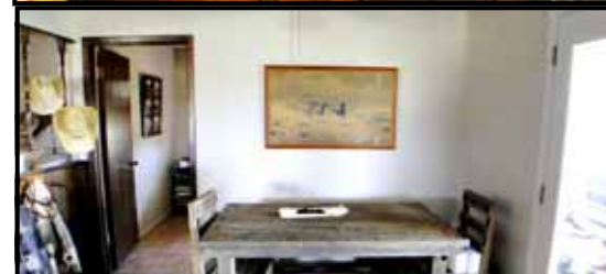
Sunlit Breakfast Nook