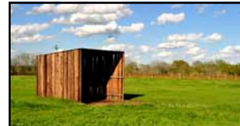
Custom Loafing Sheds