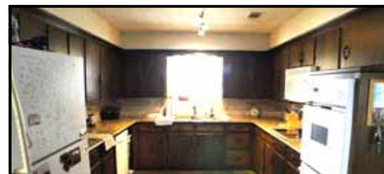
Recently Updated Kitchen