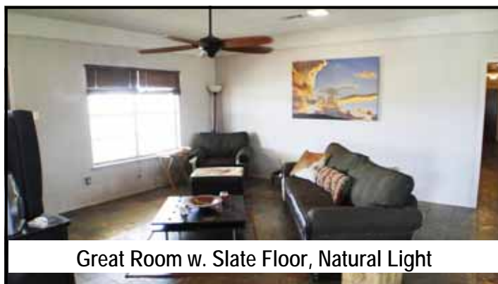
Great Room w. Slate Floor, Natural Light