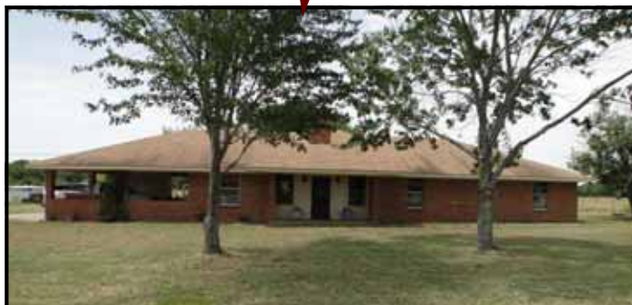
Ranch Style 3 Bedroom, 2 Bathroom Home