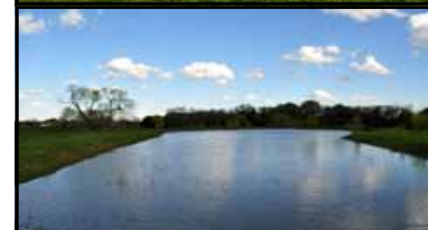
Lake on Property