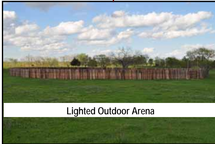
Lighted Outdoor Arena

Attractive ranch crowned by nice 3 bedroom, 2 bathroom home updated with Granite, Slate floors in living areas. This 66.65 acres has pipe fencing, set up for cattle and horses, outdoor lighted cutting arena, round pen, cattle pens, loafing sheds, improved pastures. Well water and co-op water at road. Don't miss this one!