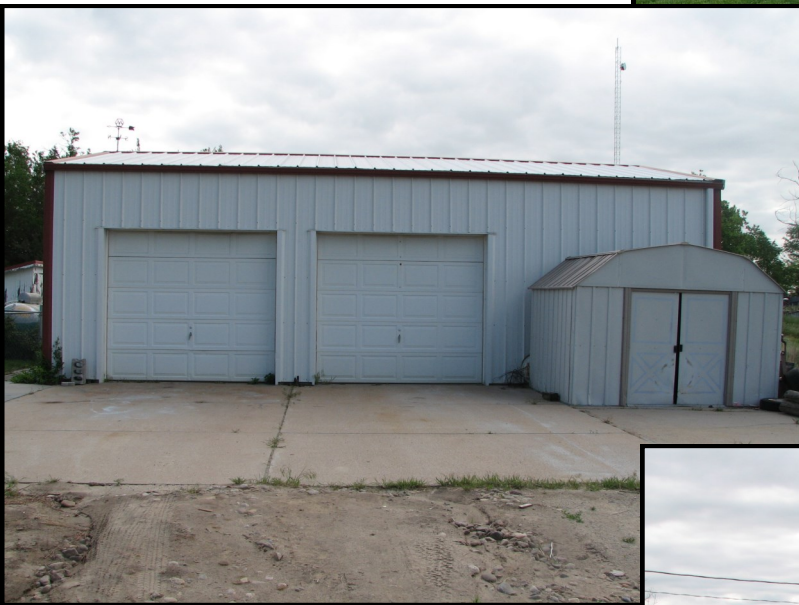
Morton Building 2 Car Garage & Work Shop Area