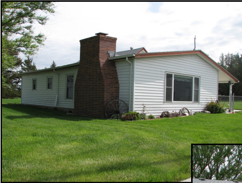
West side of house