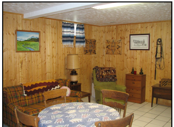
Den in Basement