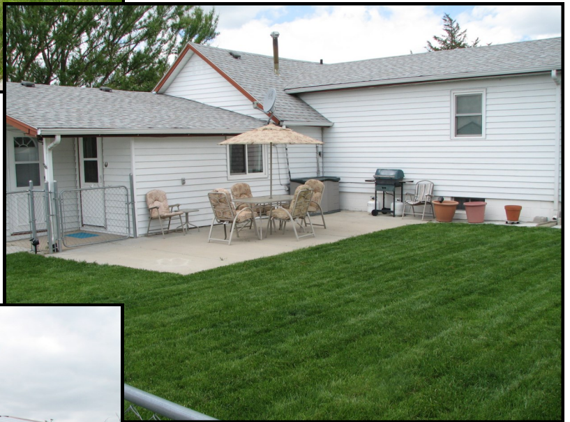
Fenced yard with sprinkler system & patio area