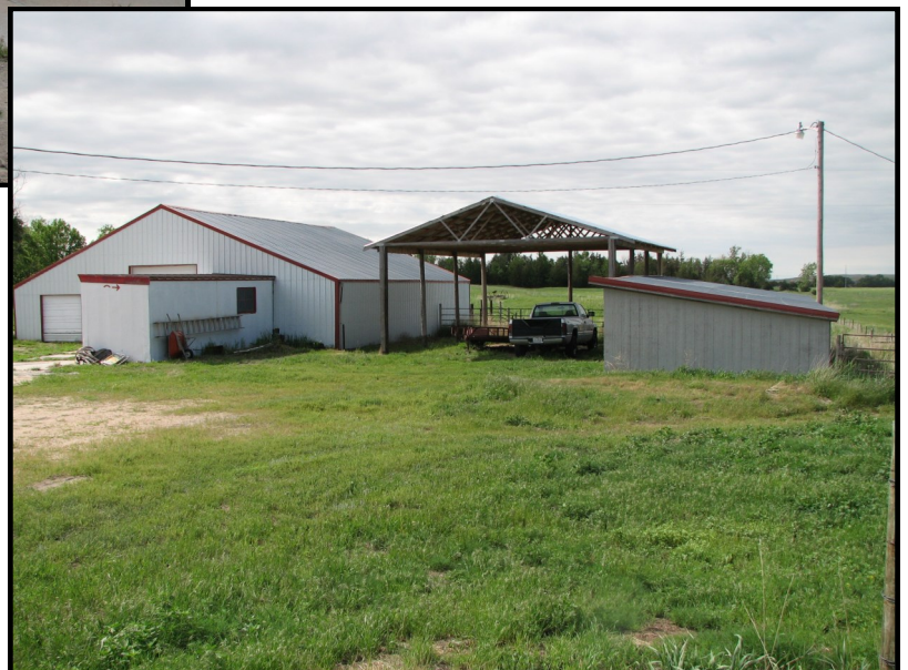
Barn, RV Cover & Storage Shed