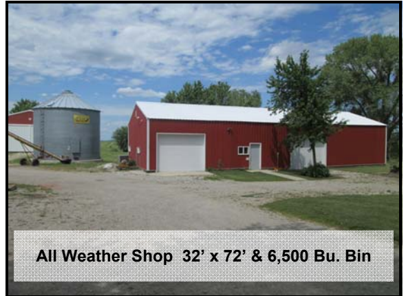
All Weather Shop 32' x 72' & 6,500 Bu. Bin