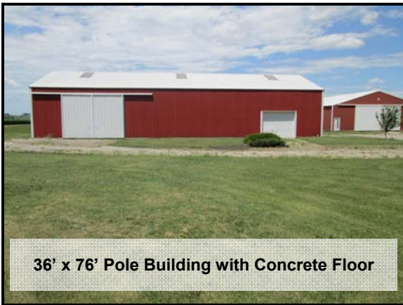
36' x 76' Pole Building with Concrete Floor