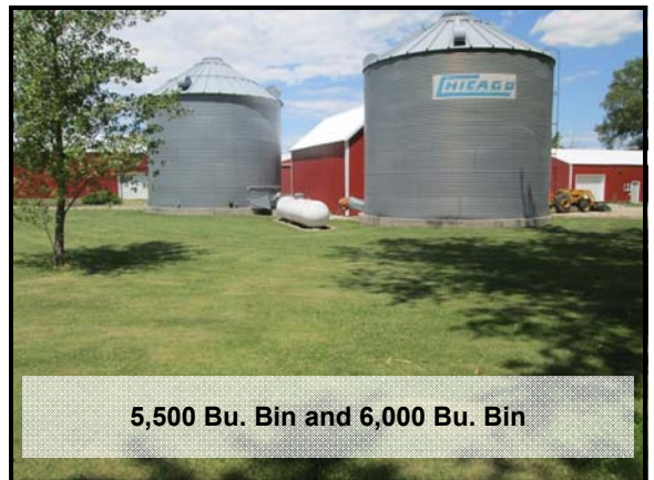
5,500 Bu. Bin and 6,000 Bu. Bin

ADDITIONAL PHOTOS COMING SOON TO WEBSITE - WWW.HERTZ.AG