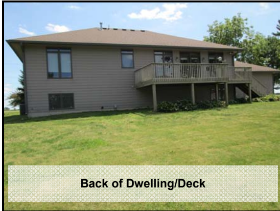
Back of Dwelling/Deck