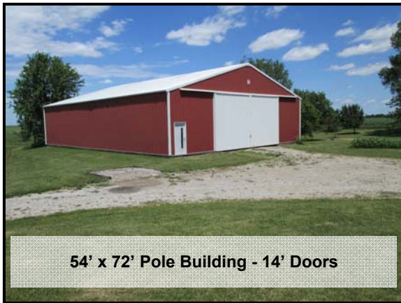
54' x 72' Pole Building - 14' Doors