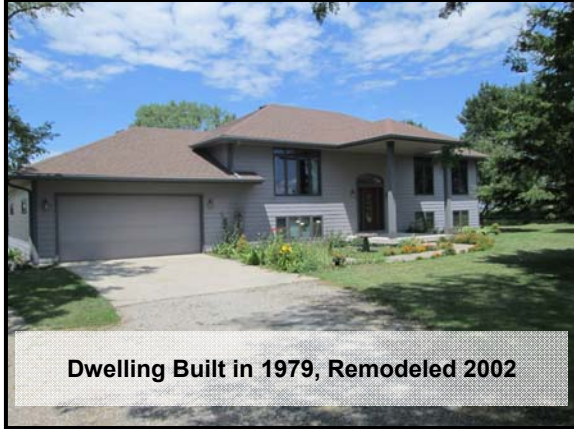
Dwelling Built in 1979, Remodeled 2002