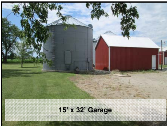
15' x 32' Garage