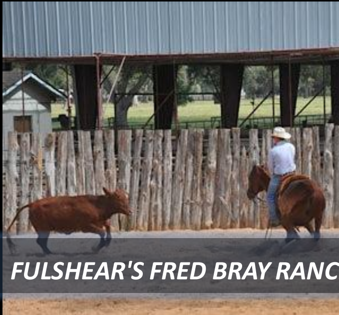
FULSHEAR'S FRED BRAY RANCH Facilities