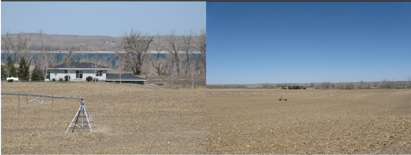
Irrigated ground with home, Lake McConaughy and 3 Tower Zimmatic Sprinkler .

"We make it happen... You make it home!"