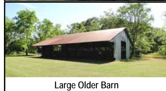
Large Older Barn