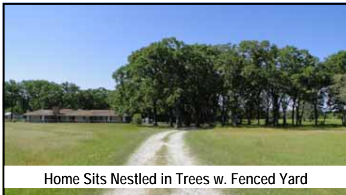
Home Sits Nestled in Trees w. Fenced Yard