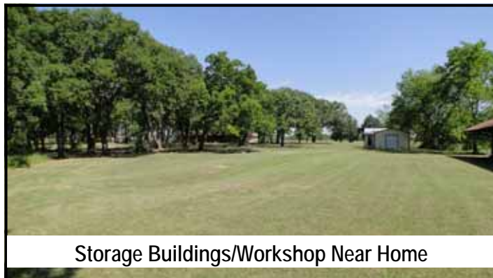
Storage Buildings/Workshop Near Home