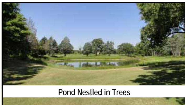
Pond Nestled in Trees