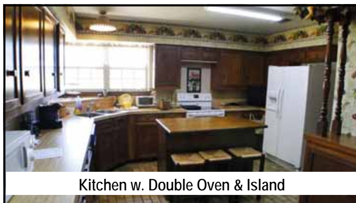
Kitchen w. Double Oven & Island