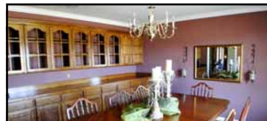
Formal Dining w. Beautiful Built-ins