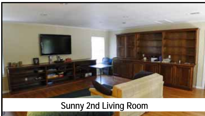
Sunny 2nd Living Room