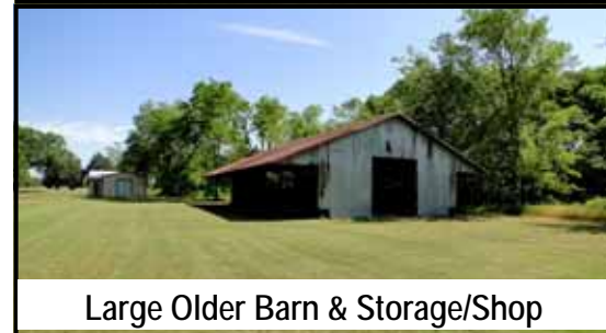
Large Older Barn & Storage/Shop