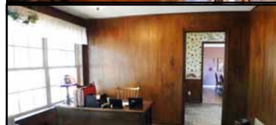
Study w. Brick Floors