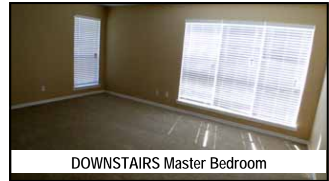
DOWNSTAIRS Master Bedroom

Enjoy this master bedroom suite with plenty of natural light and master bathroom boasting 2 sinks, ceramic tile, separate shower and walk-in closet.