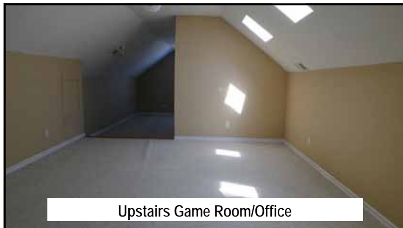
Upstairs Game Room/Office