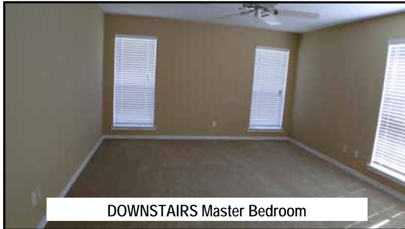
DOWNSTAIRS Master Bedroom