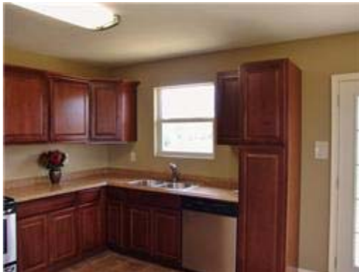
Kitchen window offers a view of the fenced back yard