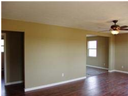
Spacious Living room with rich, wood laminate floors