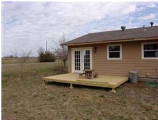
Back yard & deck