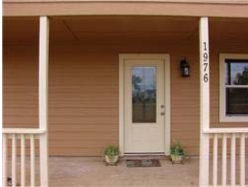
Front door & inviting porch