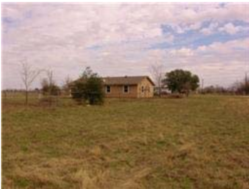
Rear view of the property