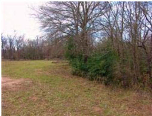
Open acreage leading to wooded area