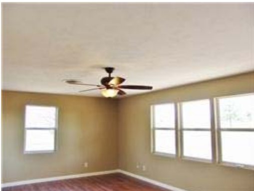
Living room showcases the natural light