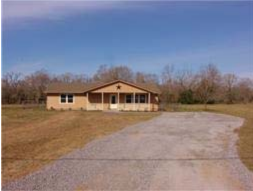
Front view - shows like a brand-new home!