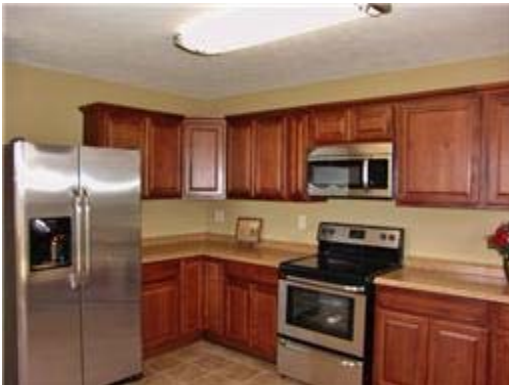
Kitchen - new cabinets, new Stainless appliances