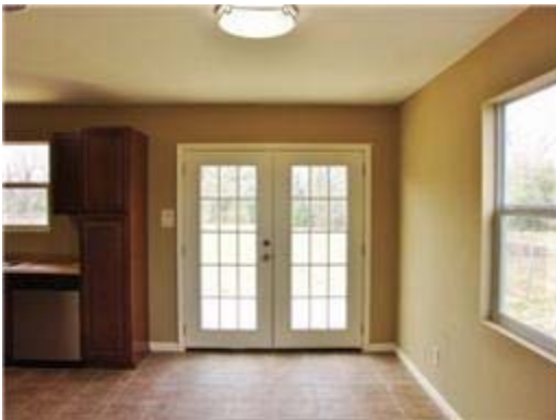
Breakfast room with French doors leading to new deck