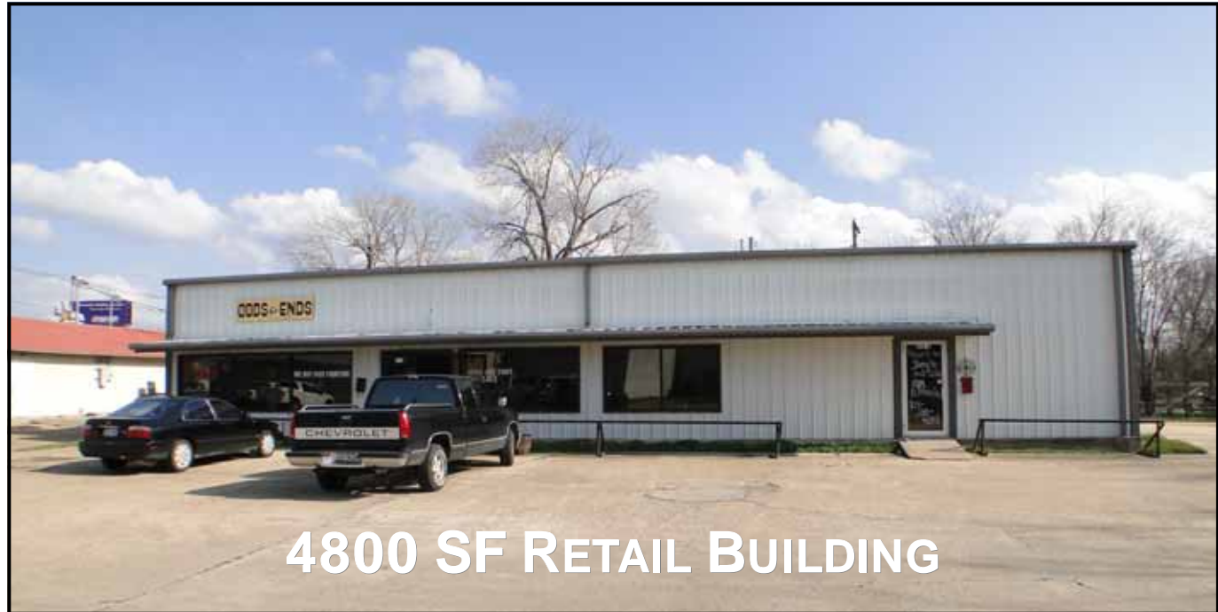
4800 SF RETAIL BUILDING