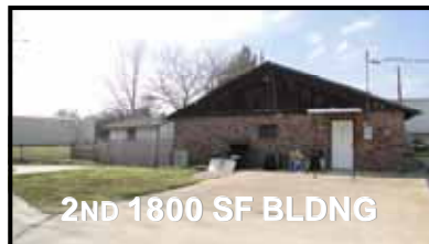
2ND 1800 SF BLDNG