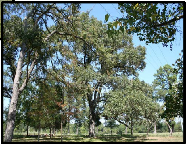
Majestic Trees Grace Property