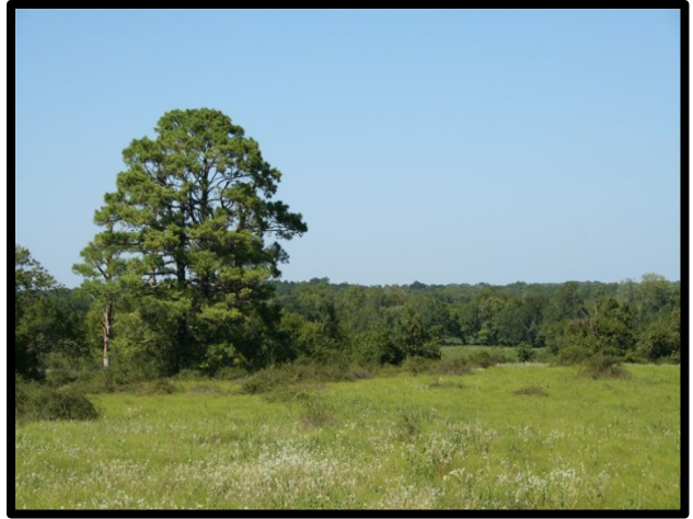
Several Homesite Locations