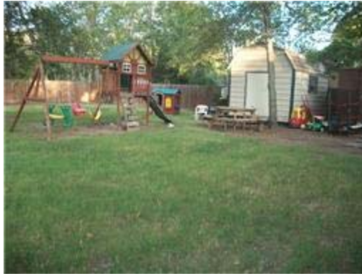
Large, privacy-fenced back yard.

Data Not Verified/Guaranteed by MLS Obtain signed HAR Broker Notice to Buyer Form