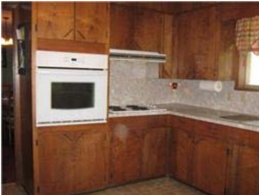
Open kitchen w/ range & wall oven makes holiday meal prep a breeze!