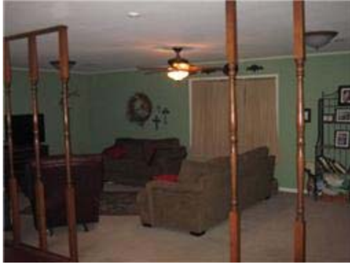
Over sized living room - designed with entertaining in mind!