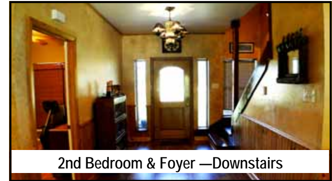
2nd Bedroom & Foyer —Downstairs

Upstairs, 2nd and 3rd bedrooms off large game room overlooking downstairs living and kitchen areas