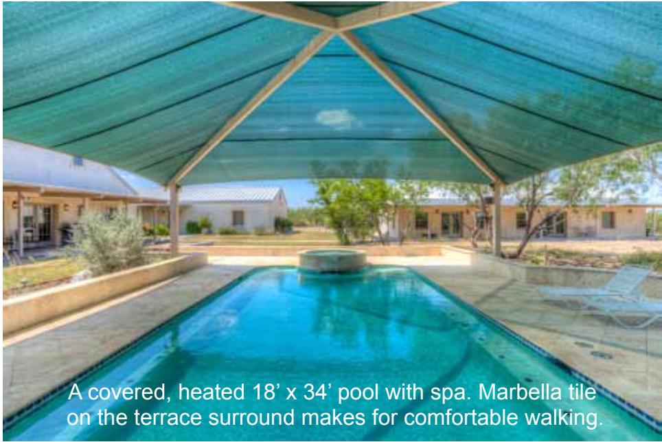
A covered, heated 18' x 34' pool with spa. Marbella tile on the terrace surround makes for comfortable walking.