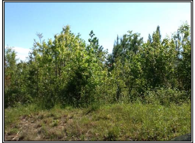
YOUNG NATURAL PINES AND HARDWOODS