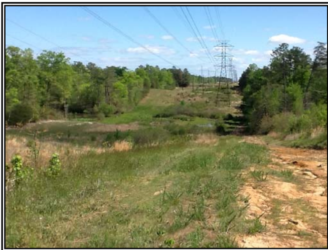
VIEWS TOWARD THE LOW GROUND