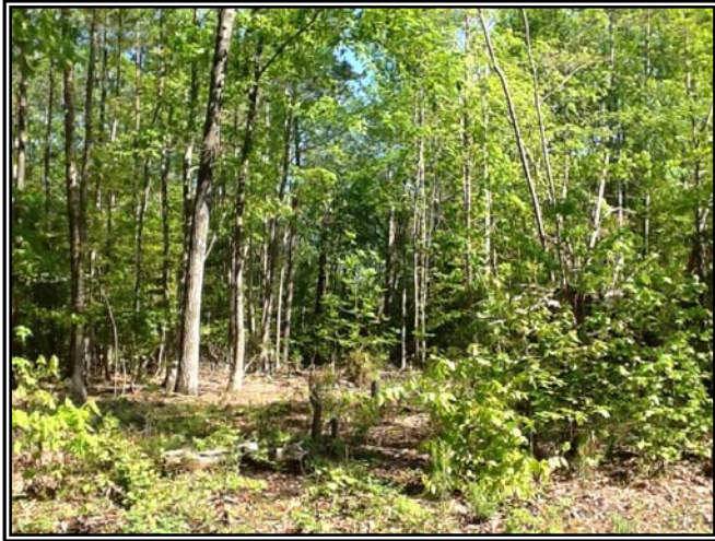
MIXED WOODLAND ALONG IVEY HILL RD