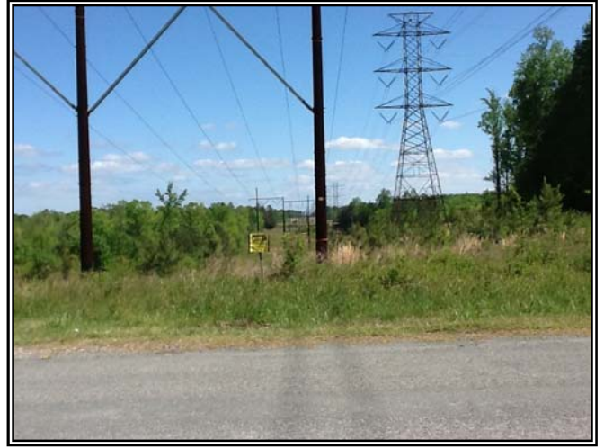
HIGH VOLTAGE POWERLINES CROSSING SUBJECT PROPERTY