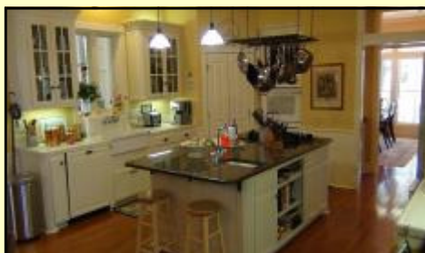
Kitchen boasts gas range stove, walk-in pantry, & GE Monogram Appliances.