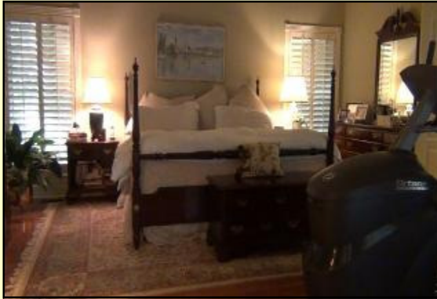
Master bedroom complete with sitting/workout area.