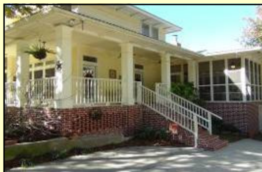
Wrap around porch has alternate entrance to home through the screened in porch.