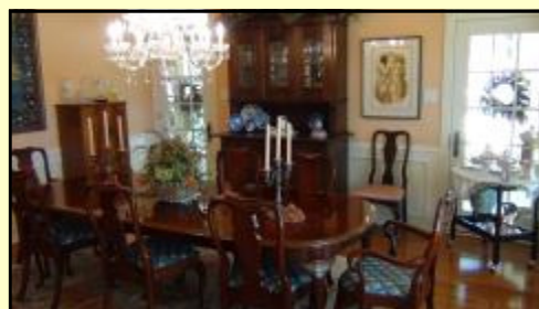
Formal Dining shown seating 8 but could seat 12 comfortably