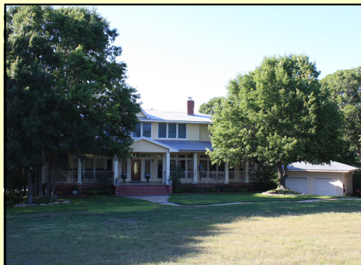
Trees engulf the home and garage!