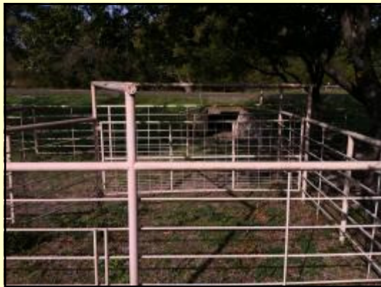
Cattle Crossing under FM 308 complete with pens and chutes.