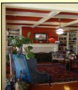
Office w/ fireplace, built ins, large closet, & perfect coffer ceiling.