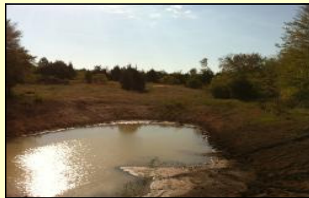
One of the tanks on the property.

1008 Ferris Ave | Waxahachie, TX 75165 | Ofc. 469-517-0012 | Fax 469-517-0015