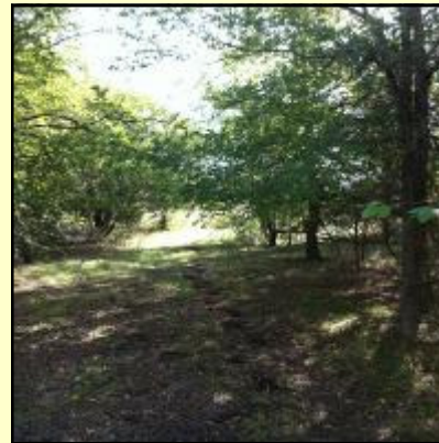
Portions of the property are heavily treed and the rest is currently grazing land.