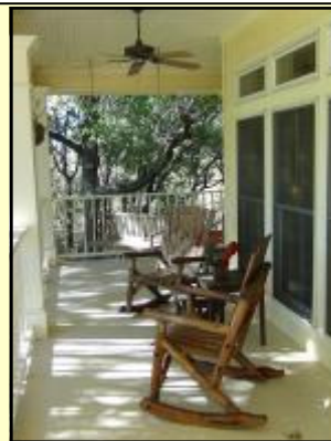
1500 SF of amazing covered porch area!