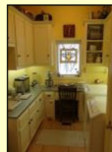
Utility Room includes built ins for storage, sink, freezer, & broom closet.

Information contained herein has been obtained from the owner of the property or obtained from other sources that we deem reliable. We have no reason to doubt its accuracy, but we do not guarantee it.