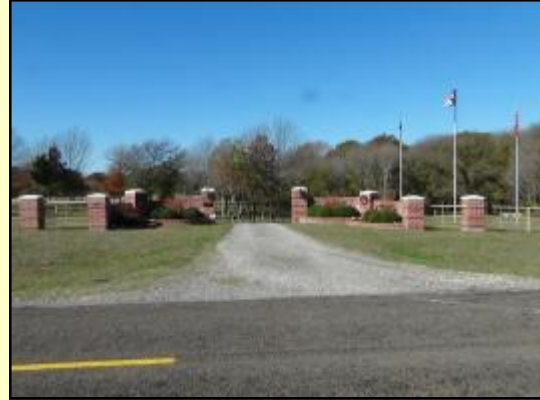
Grand brick and rod iron entrance.