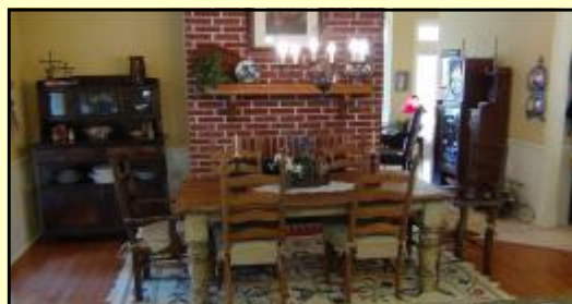
See-through fireplace in Kitchen and Den.