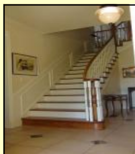
Inviting stairwell leads to guest bedrooms, bathrooms, and media room.