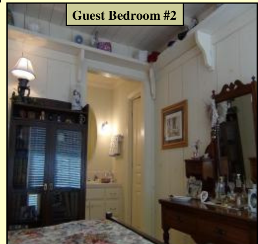
Guest Bedroom #2

Information contained herein has been obtained from the owner of the property or obtained from other sources that we deem reliable. We have no reason to doubt its accuracy, but we do not guarantee it.