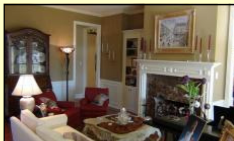
Formal living is centered around the gorgeous fireplace.