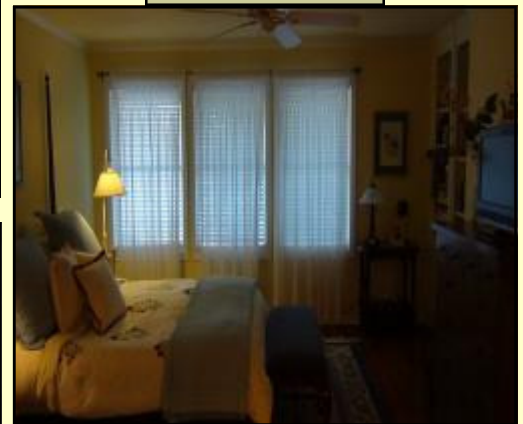
Guest Bedroom #1