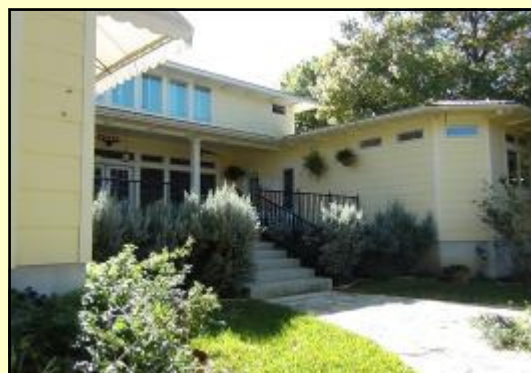
House Surrounds back porch which is perfect for gatherings!