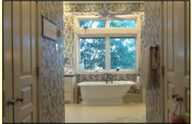
Immaculate Master Bath with antique tub, His & Her Closets and Vanities