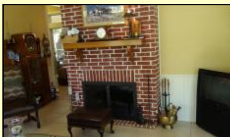
Den is cozy and relaxing. Fireplace doors are hand forged steel (cost over $4,000).