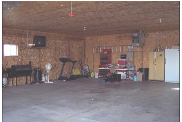
Another View of Garage Interior