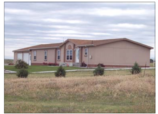
Another view Home