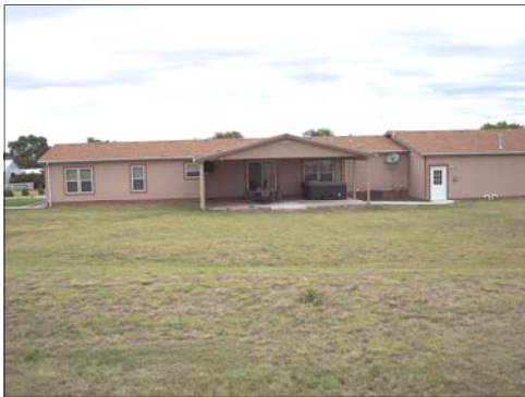
View of Home from South