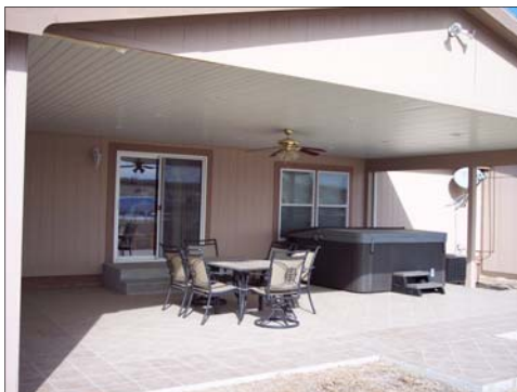
Tiled Patio with Hot Tub