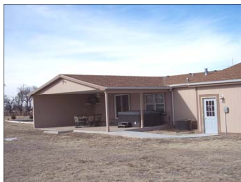
Patio & Garage Door from SE