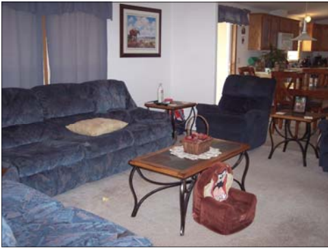
View of Family Room