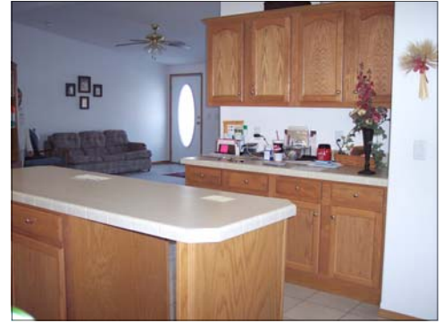
More Kitchen Storage