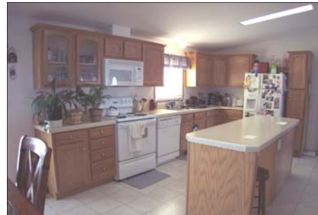
Open kitchen w /Island & Appliances