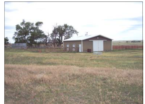
Morton Barn from East