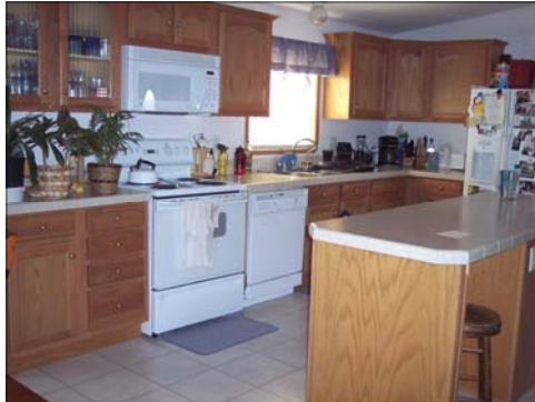
Another View of Kitchen