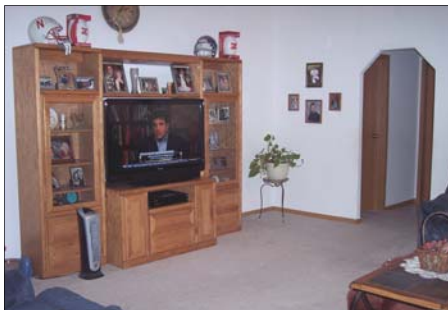
View of Family Room