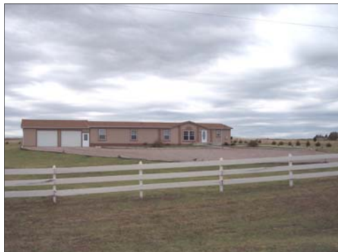
View of Home from North