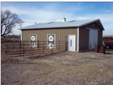
Barn & Pens west of Home