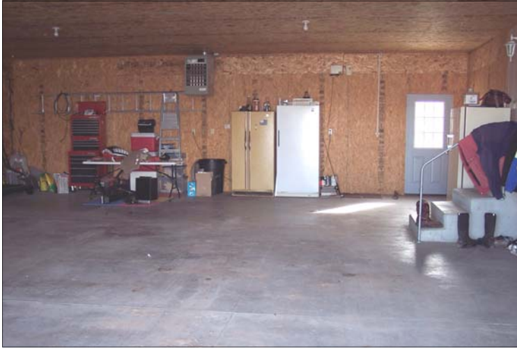
View of Garage Interior