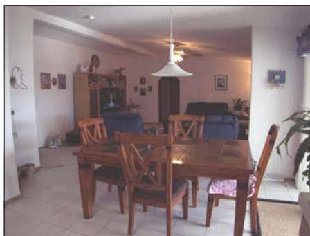
Open Dining Room Area