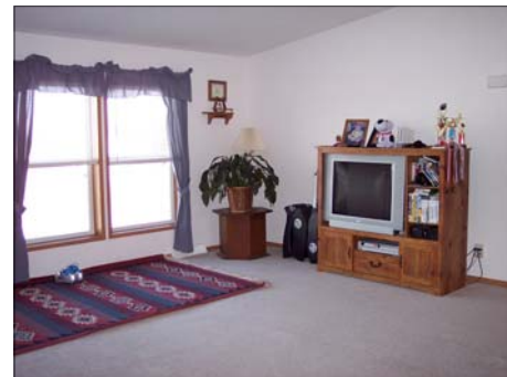
View of Living Room

More Photos of Property at SHAYREALTY.COM