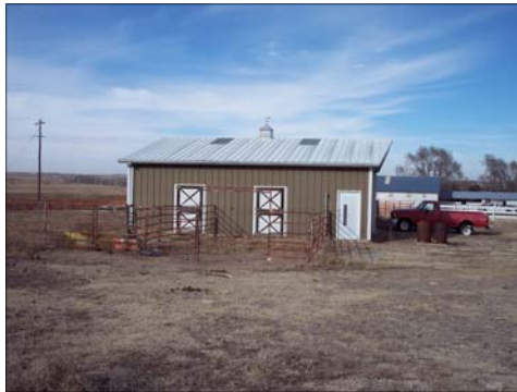
Another View of Barn