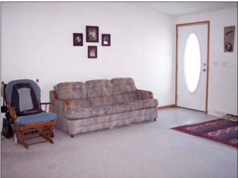
Another View of Living Room