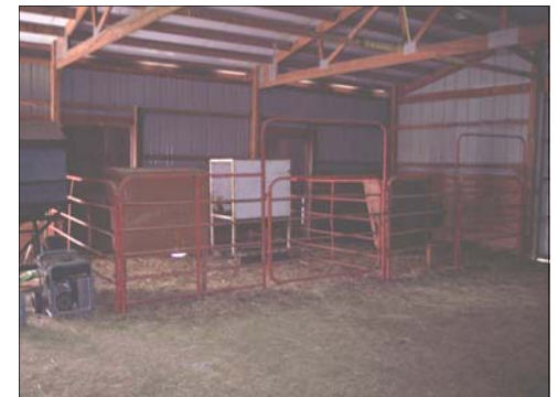
Interior of Morton Barn