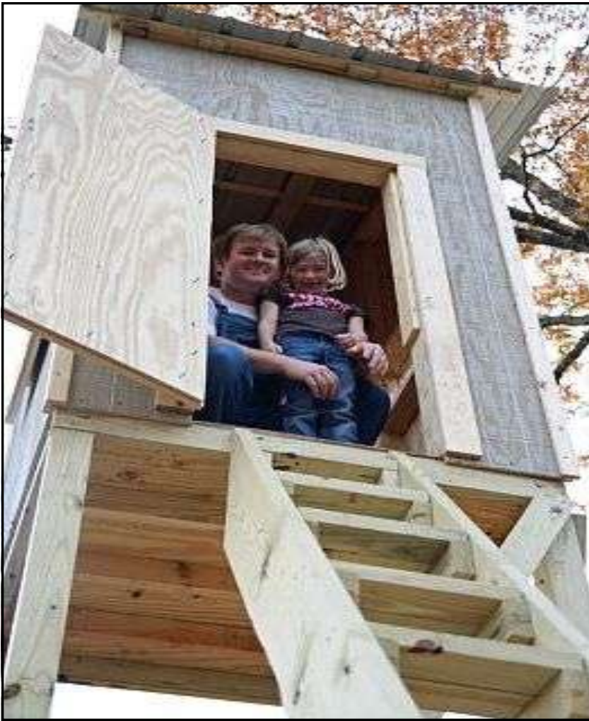
Picture of a shooting house located on large green field.

(Below) Cabin with attached storage. There is one bedroom with four bunk beds, full bath, kitchen, and a sitting area.