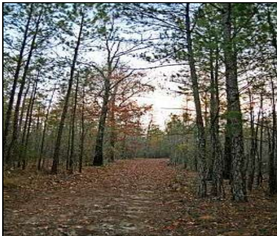
(Left) view of road leading to Lake.