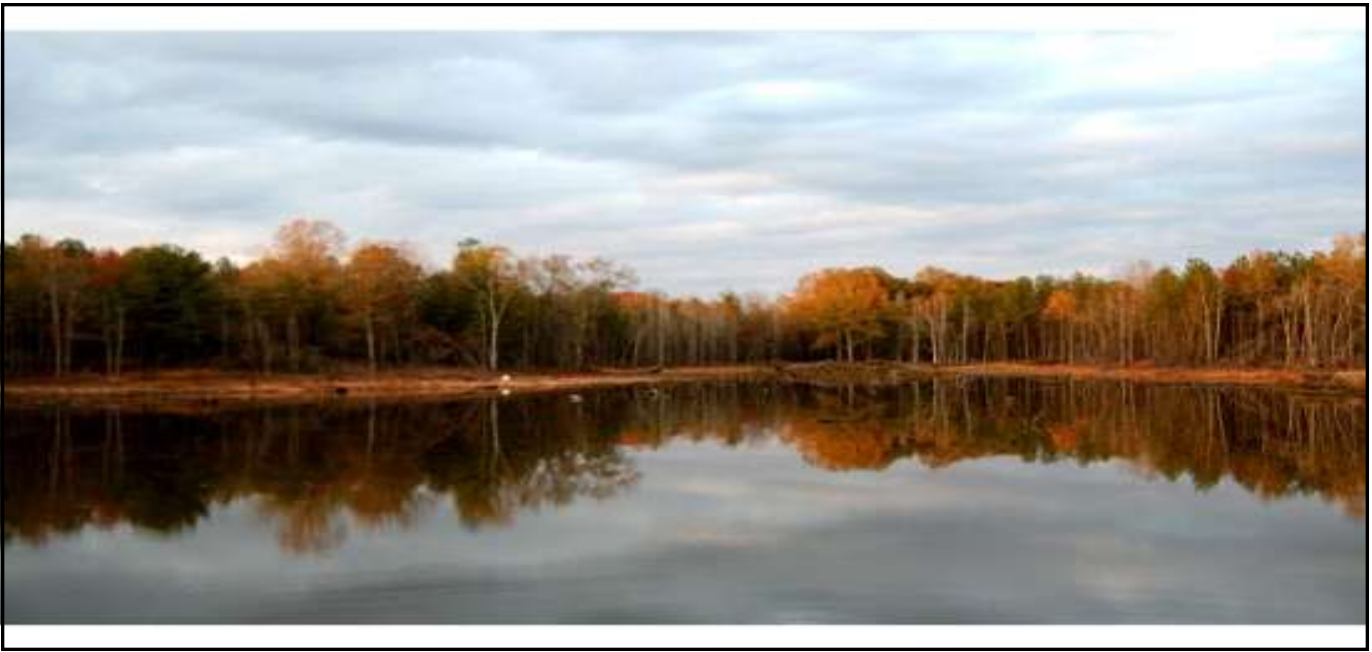
Above is the 13 acre lake that was stocked in 2007 by American Sportfish Hatchery. The initial stocking consisted of 15,000 Coopersnose and Northern Bluegill. Followed by stocking with Tiger Bass.