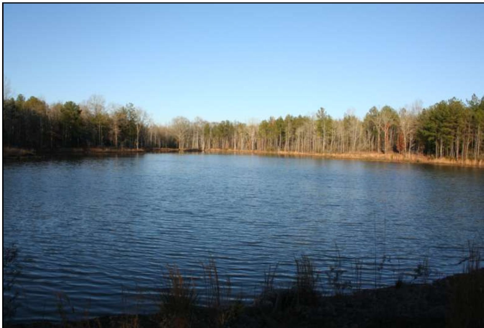
(Below) view of Lake from dam looking North