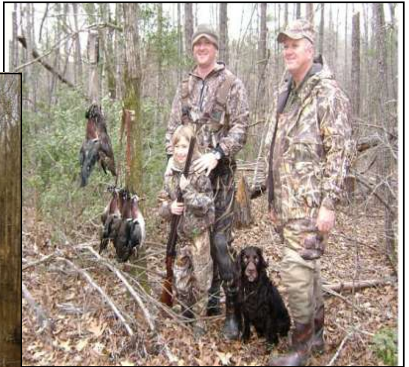
(Left) View of 1.5 acre Duck Pond with valve to drain and flood as needed. (Right) Smiles all around after a successful morning shooting ducks!