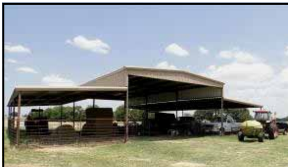
Equipment & Hay Shed