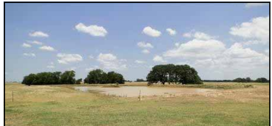
Stock Pond with Fencing for Cattle