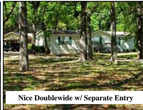
Nice Doublewide w/ Separate Entry