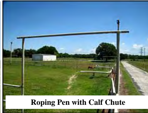
Roping Pen with Calf Chute