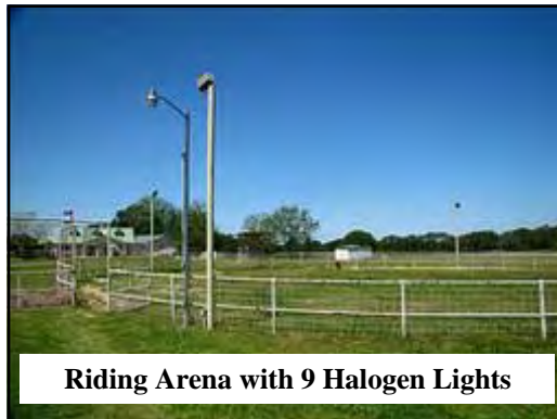
Riding Arena with 9 Halogen Lights