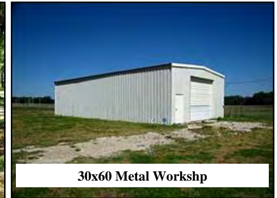
30x60 Metal Workshop