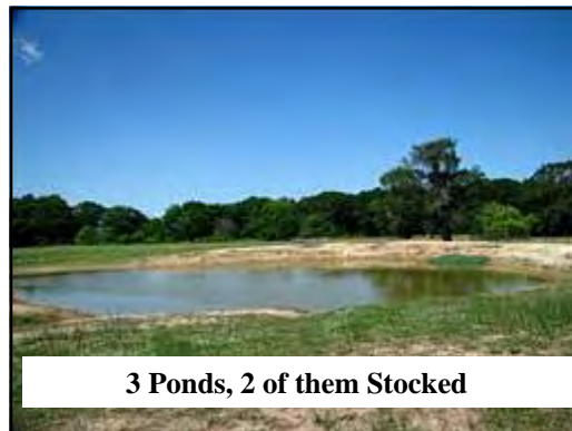
3 Ponds, 2 of them Stocked