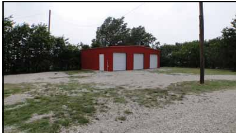
Large metal workshop/detached garage