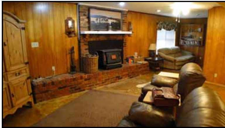
Living Room with Concrete Flooring + Metal Box Fireplace and long brick hearth

Ranch-style 3 bedroom, 3 bathroom home, just right for family getaway or country home!