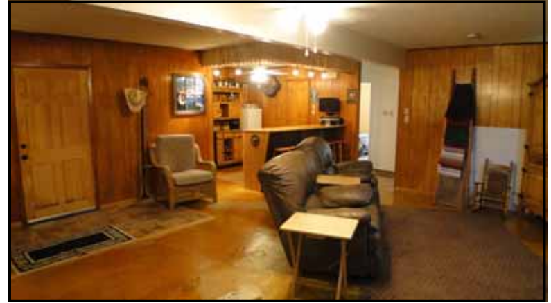
Kitchen and Living Room flow easily for good entertaining