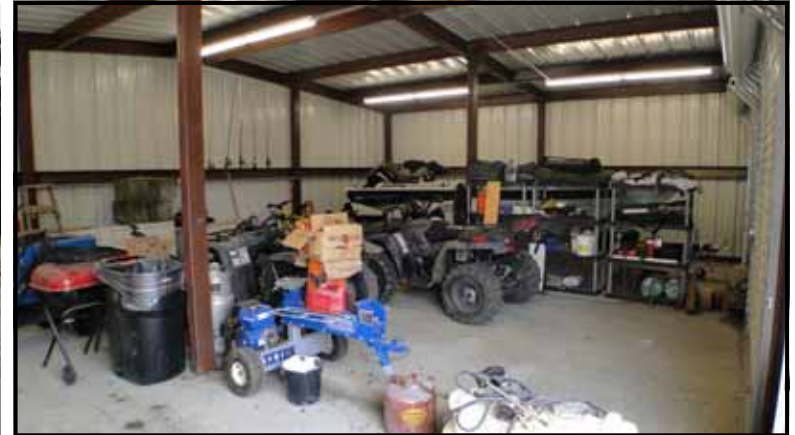
Inside of workshop