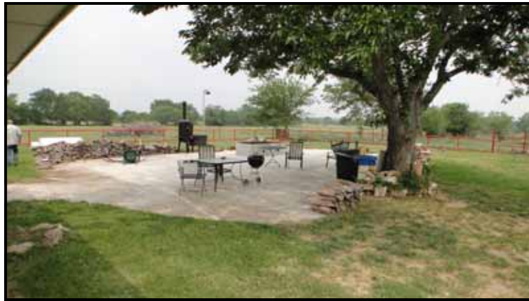
Outside Open Stone Patio with shade tree and grilling area

Good cattle operation as well as a nice large lake stocked with fish, and recently built shop & detached garage to store vehicles.