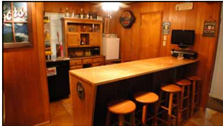
Full Wet Bar Area