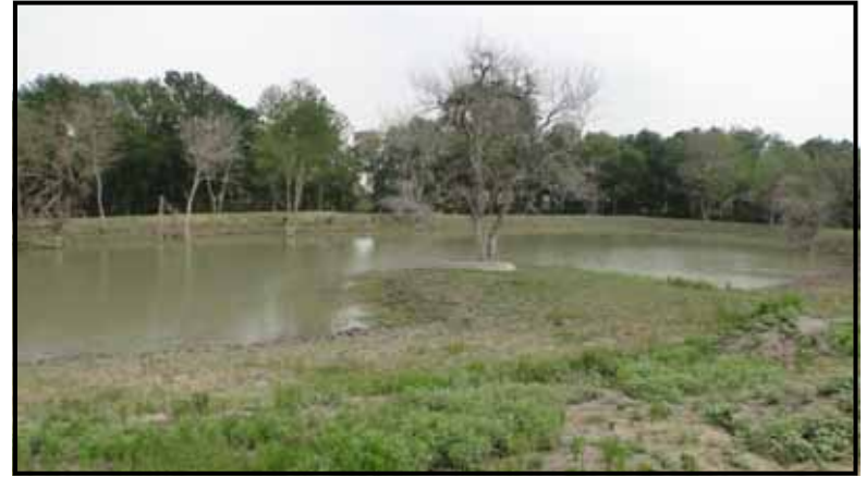
Large stocked lake