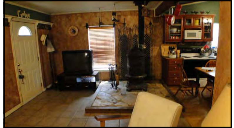
Kitchen and Living Room