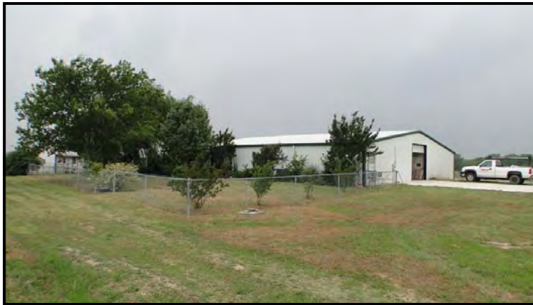
Far View of Barn/Living Quarters

Bring your horses—this property is ready to go for equine use with stables, 4 loafing sheds with runs, pipe fencing, dog kennels, round pen and a horse walker!