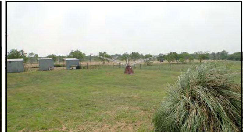
Horse Walker and Loafing Sheds