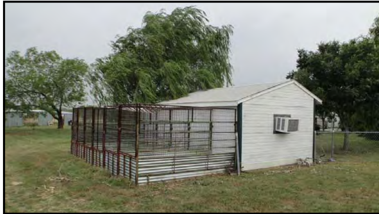
Air Conditioned Dog Kennels