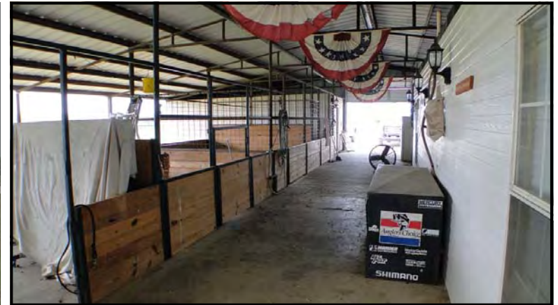
Stables Inside Barn