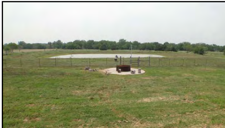
Outside Fire Pit and Pond