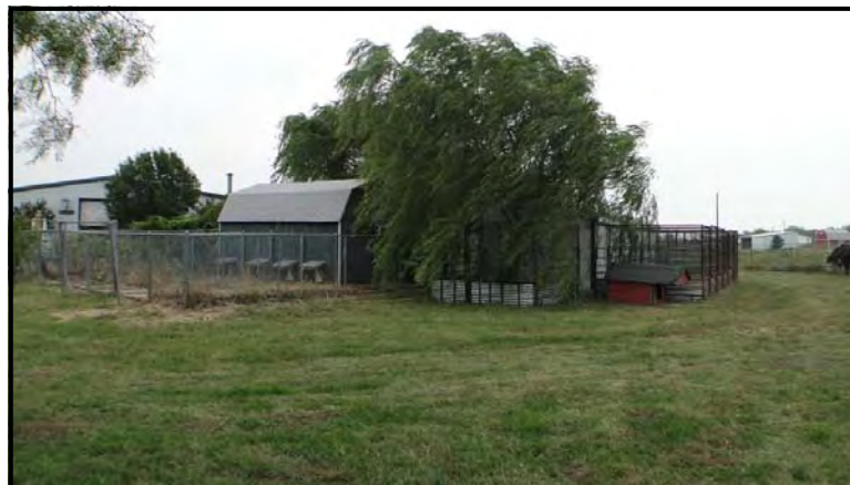
Dog Kennels and Runs