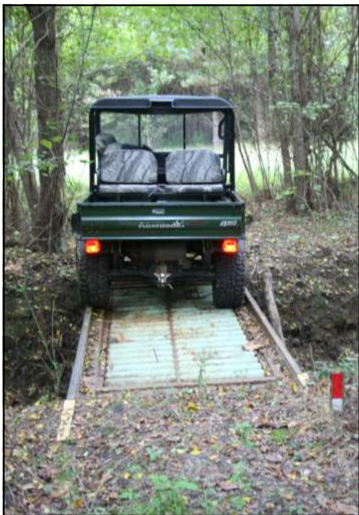
Access bridge to portion of property