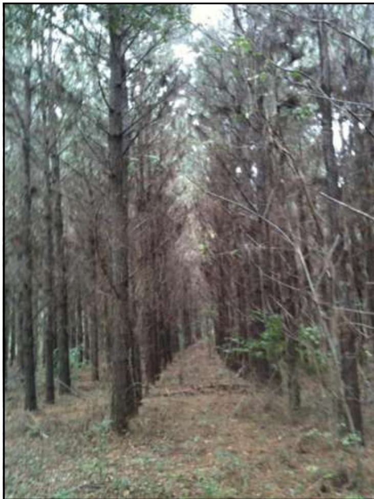
Healthy 12 year old pine plantation