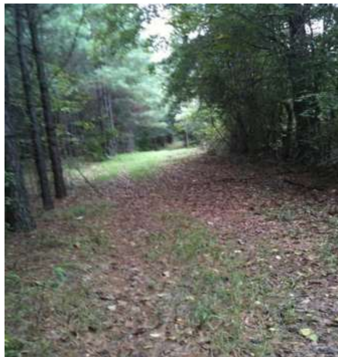
Nice roadway system through pines