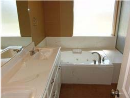
Visit the spa everyday w/ this master bath!