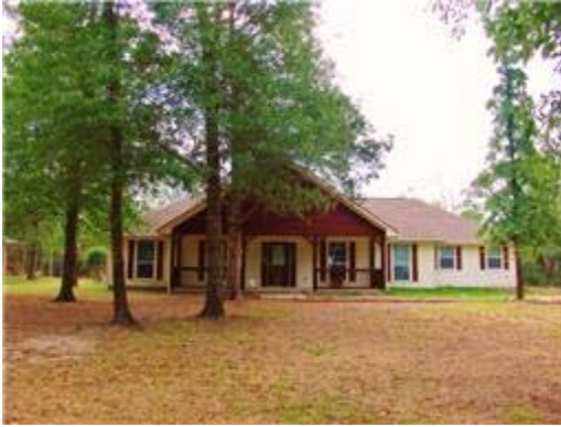
Custom home with 2.522 acres