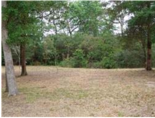
Front yard w/ rolling topography