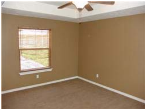
Master bedroom w/ tray ceiling