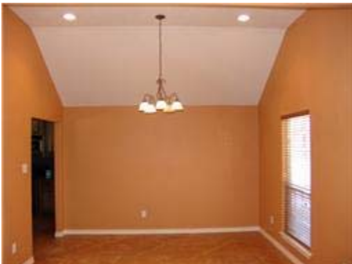
Formal dining w/ vaulted ceiling