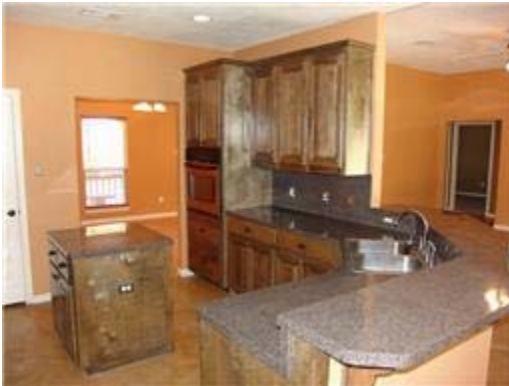
View looking into the living room