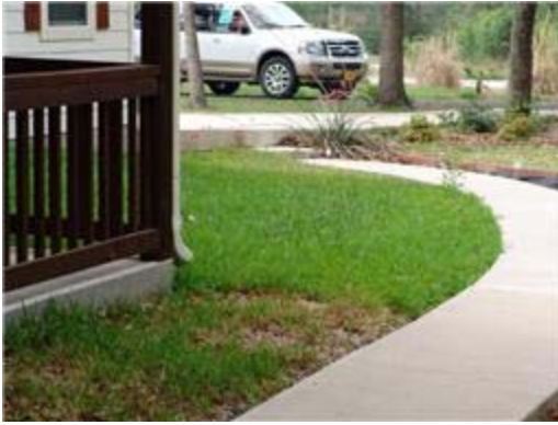
Sidewalk leading to front entrance