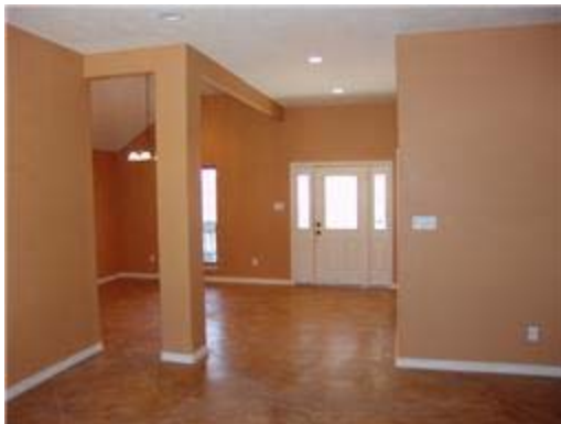
View facing the front entry; notice the beautifully stained concrete flooring