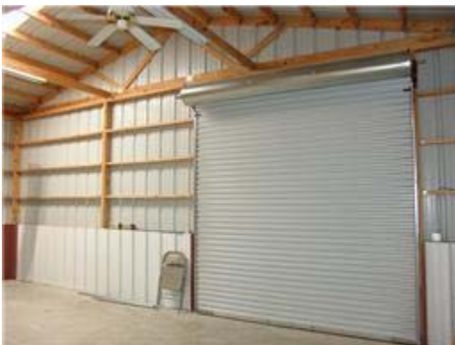
Interior of barn