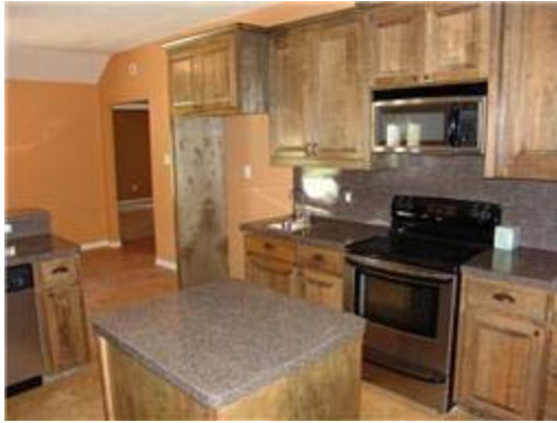
Kitchen fit for a Chef! Cooktop, wall oven, island & walk-in pantry