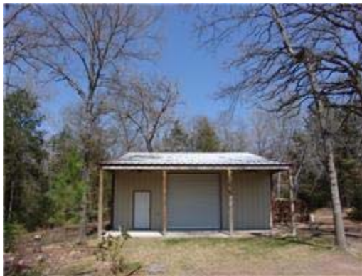
30x30 Barn w/ concrete slab, electricity & water