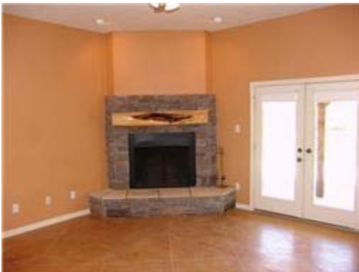
Custom wood-burning fireplace is the centerpiece of the living room