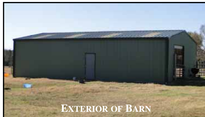
EXTERIOR OF BARN