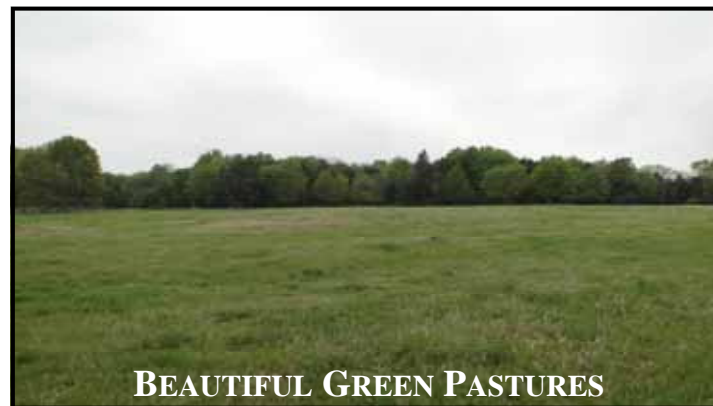
BEAUTIFUL GREEN PASTURES