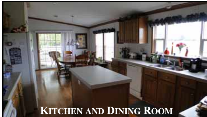
KITCHEN AND DINING ROOM