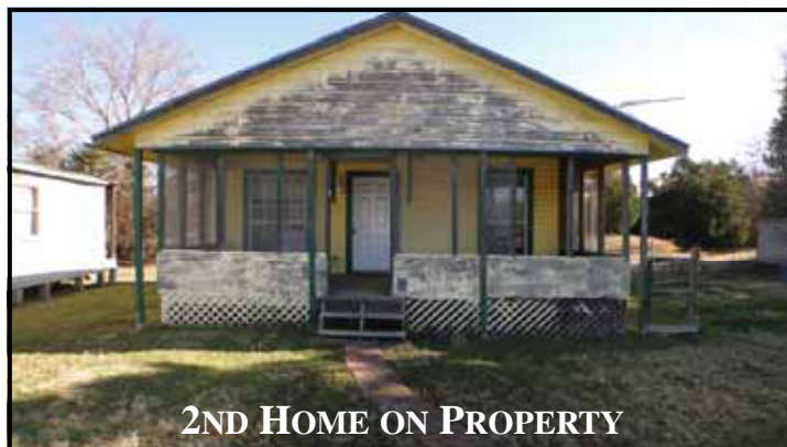
2ND HOME ON PROPERTY