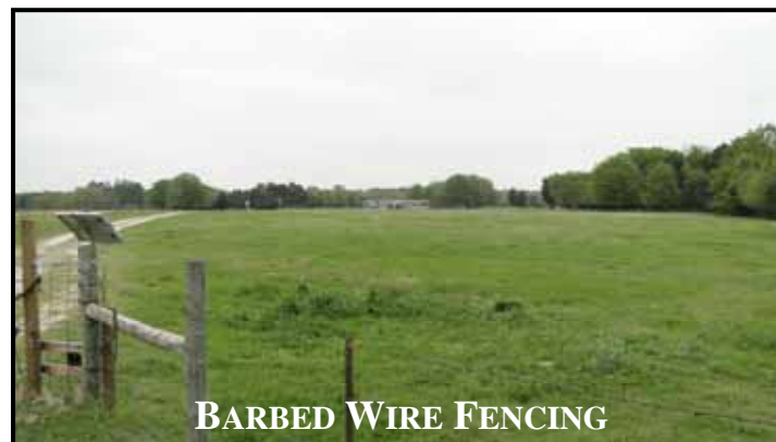
BARBED WIRE FENCING