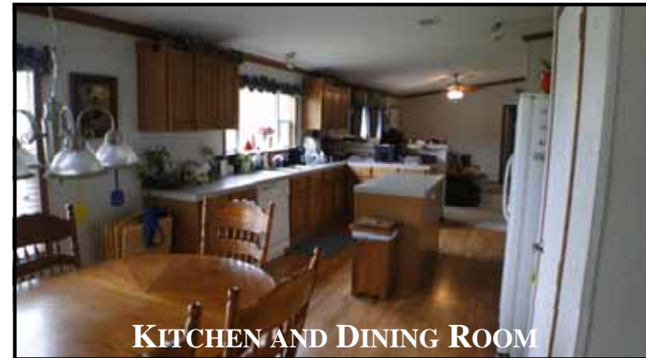
KITCHEN AND DINING ROOM