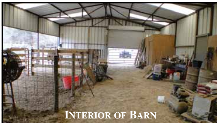
INTERIOR OF BARN