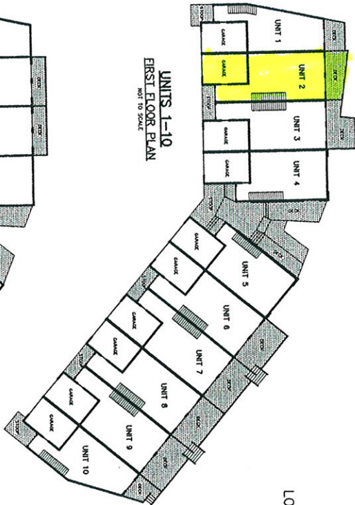
UNITS 1-10 FIRST FLOOR PLAN NOT TO SCALE