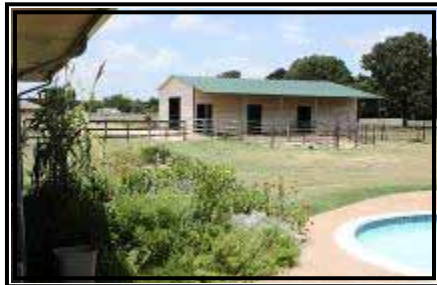
Barn from back deck