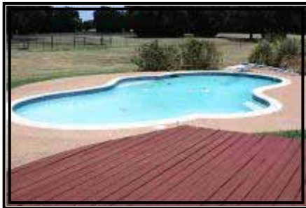
Pool and Back Deck

3 Stories with Wrap-Around Porches on 2 • Slab Foundation • Metal Roof • 48x26 Garage • Deck • In-ground Gunite Pool • Electric Water Heater • Central Heat and Air • Ceiling Fans • Carpet • Ceramic Tile • Double Oven in Kitchen • Built-ins • Walk-in Closets • Extra Storage Room • Washer/Dryer Room • High Speed Internet Available!