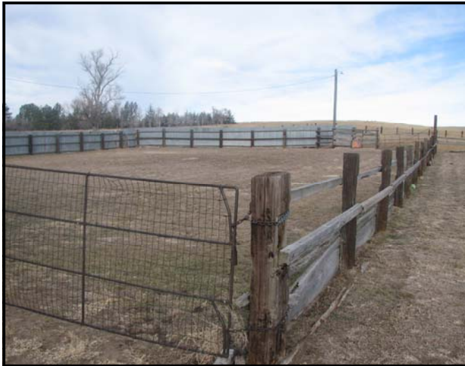
Corrals with windbreak on North & West