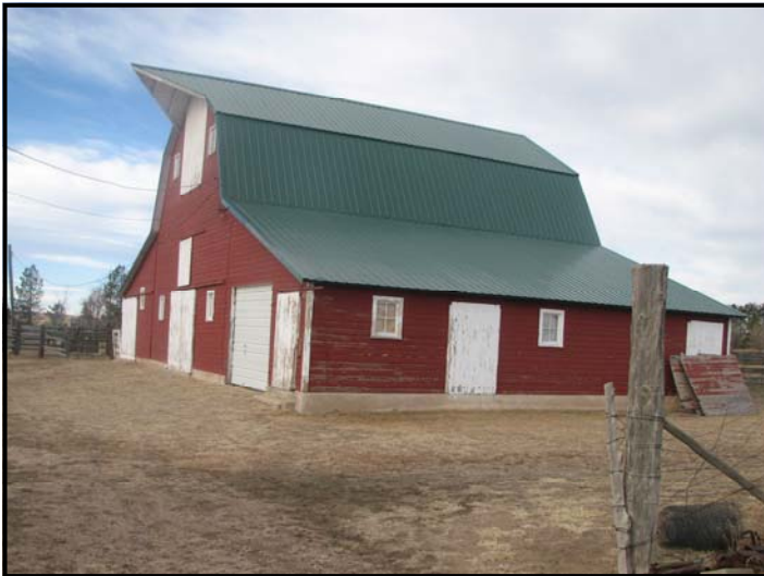
New Steel Roof on Barn