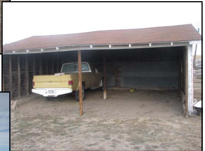
Open Front Shed