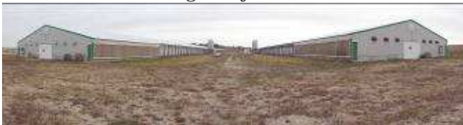
Distant View of Site