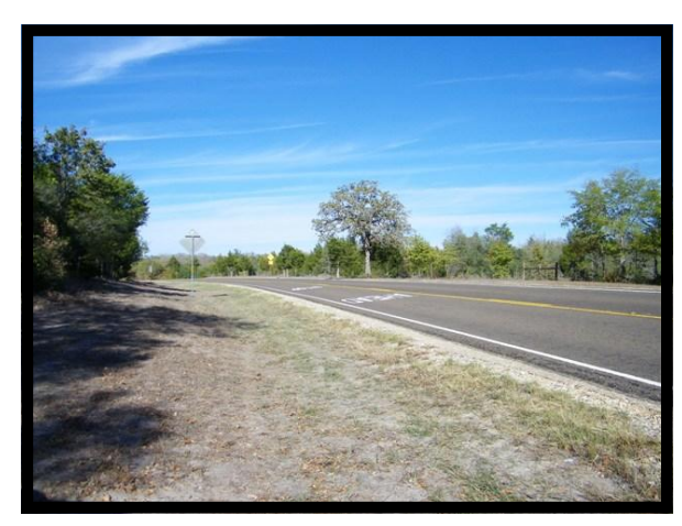
FM 1948 & FM 594/Burton, TX

Here's your chance to own small private acreage just minutes from the historic town of Burton, Texas, on the south side of Lake Somerville. Several size tracts options available out of a 21 acre property. Property is wooded with native cedars and post oak trees so you can selectively clear to suit your needs. Community water and electricity available. Subject to restrictions-single family residential and agricultural purposes only, no commercial businesses.