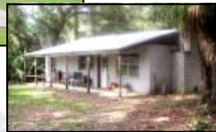
Custom Home, Barn, Camp House, Livestock and More!