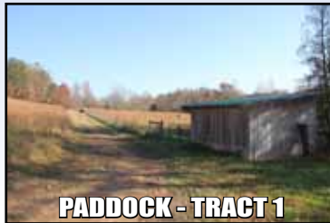
PADDOCK - TRACT 1