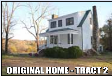
ORIGINAL HOME - TRACT 2