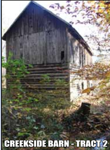
CREEKSIDE BARN - TRACT 2