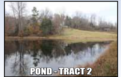
POND - TRACT 2

1780 SWAN RD ▸ PAMPLIN, VA (APPOMATTOX CO.)