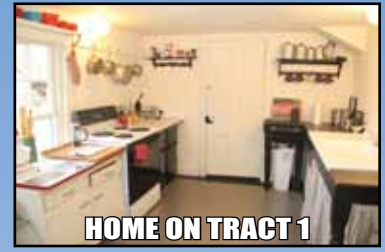
HOME ON TRACT 1