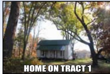
HOME ON TRACT 1