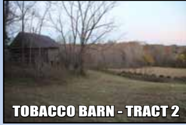
TOBACCO BARN - TRACT 2