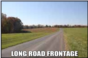
LONG ROAD FRONTAGE

Established in 1763, the Gilliam-Irving Farm is rich in early American history