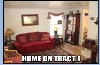
HOME ON TRACT 1