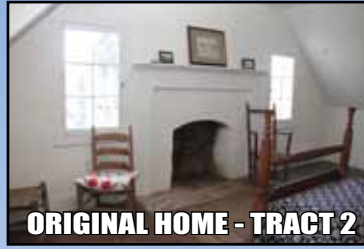
ORIGINAL HOME - TRACT 2