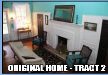
ORIGINAL HOME - TRACT 2