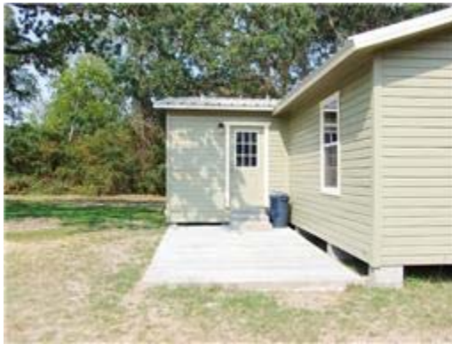
Back patio - perfect place for summer grilling