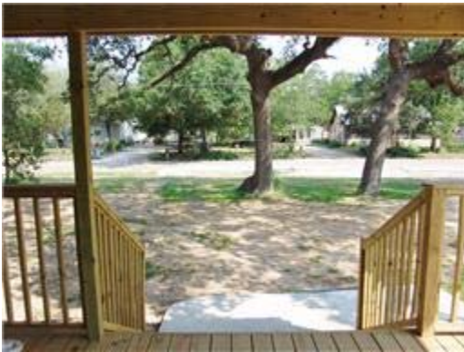
View of the front yard