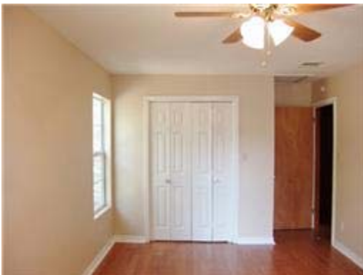
Master bedroom -2nd view.