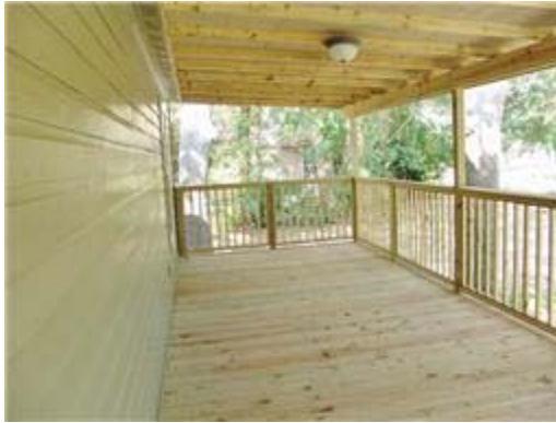
Front Porch - brand new with treated lumber & fixtures