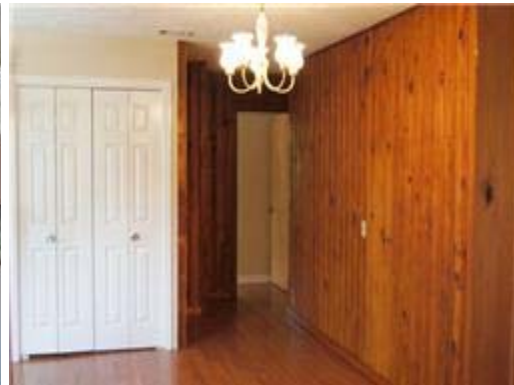
Formal Dining conveniently located next to kitchen