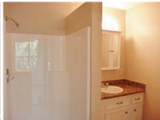
Master bath w/ walk-in shower