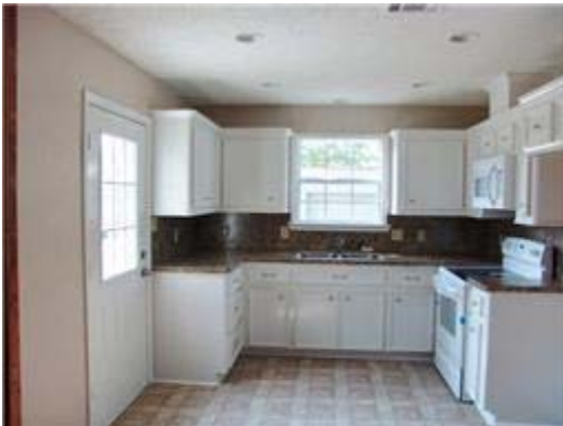
Kitchen - new cabinets, appliances & counter tops