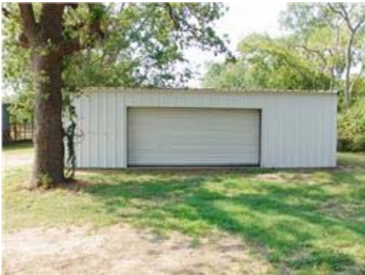
2-car detached garage

Data Not Verified/Guaranteed by MLS Obtain signed HAR Broker Notice to Buyer Form