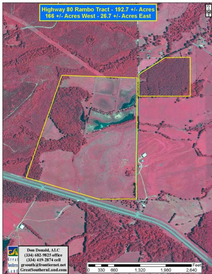
COLOR INFRARED AERIAL