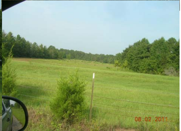
RAMBO HIGHWAY 80 TRACT PHOTOGRAPHS