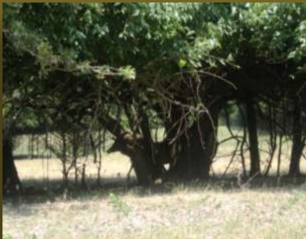
Buck Deer Behind Tree