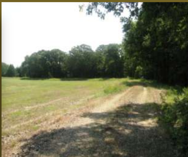
Driveway along the Timber