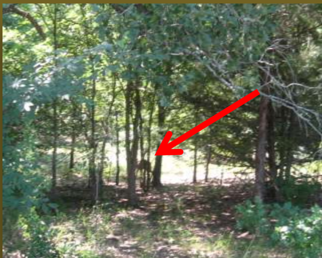
Doe in the Trees