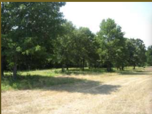
Rear Meadow View