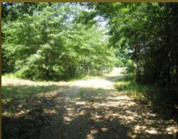
Drive Through The Trees