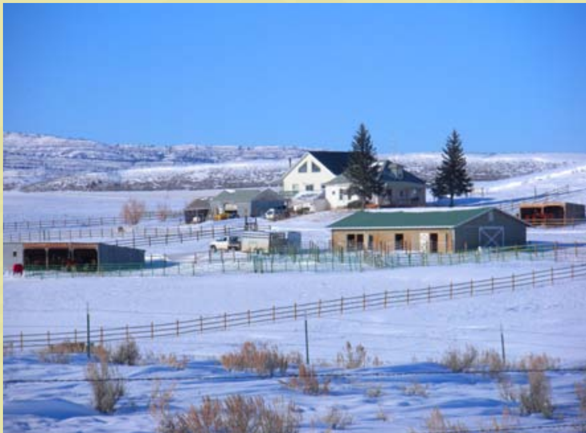
View of the Crazy's coming onto Hwy 89 N from the ranch.