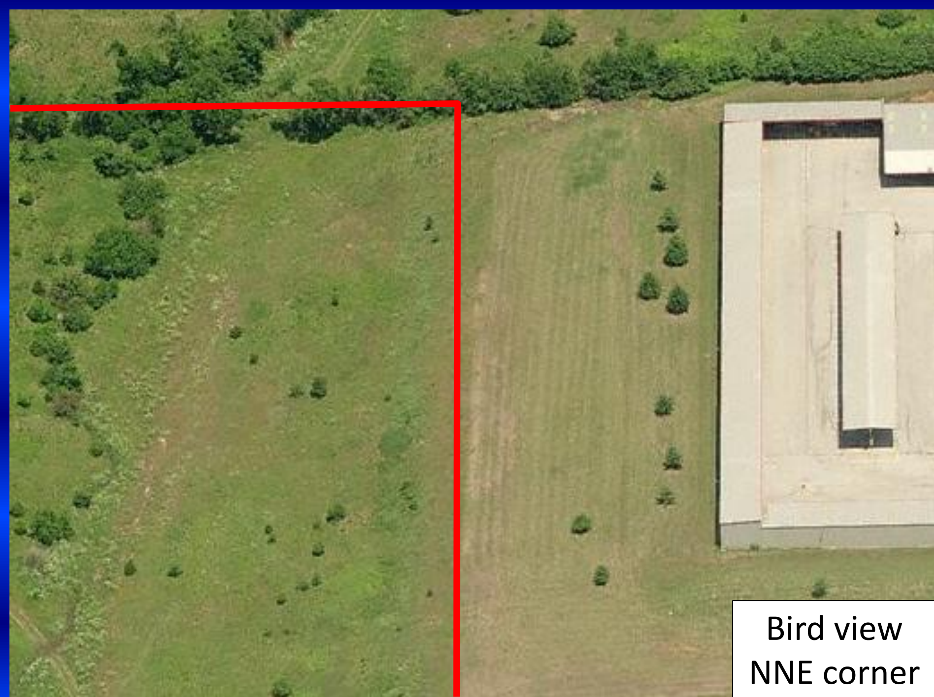
Bird view NNE corner