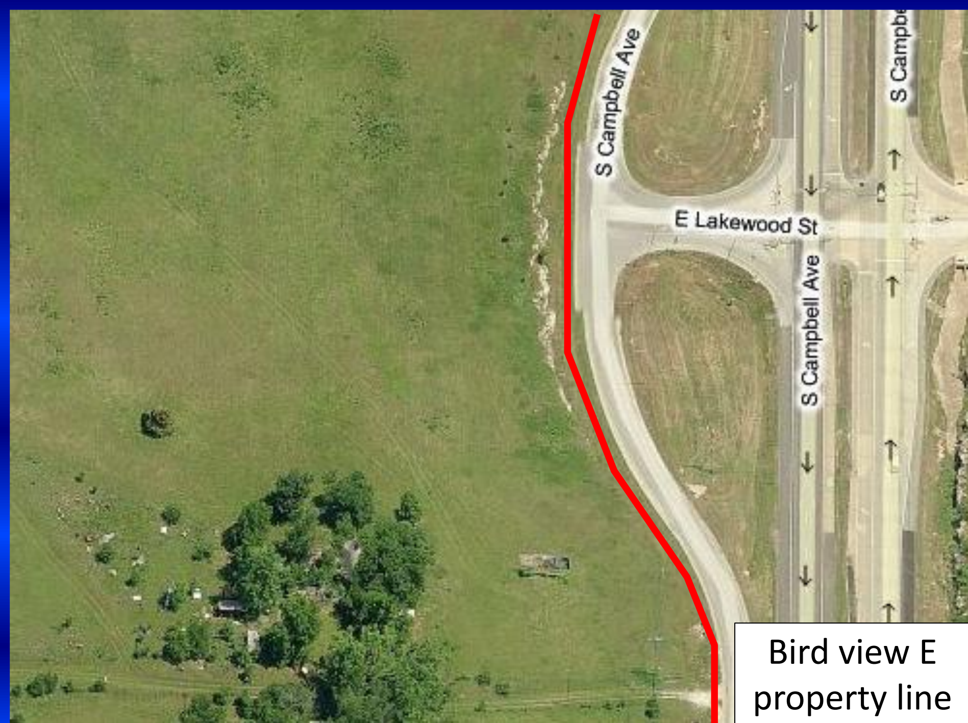
Bird view E property line