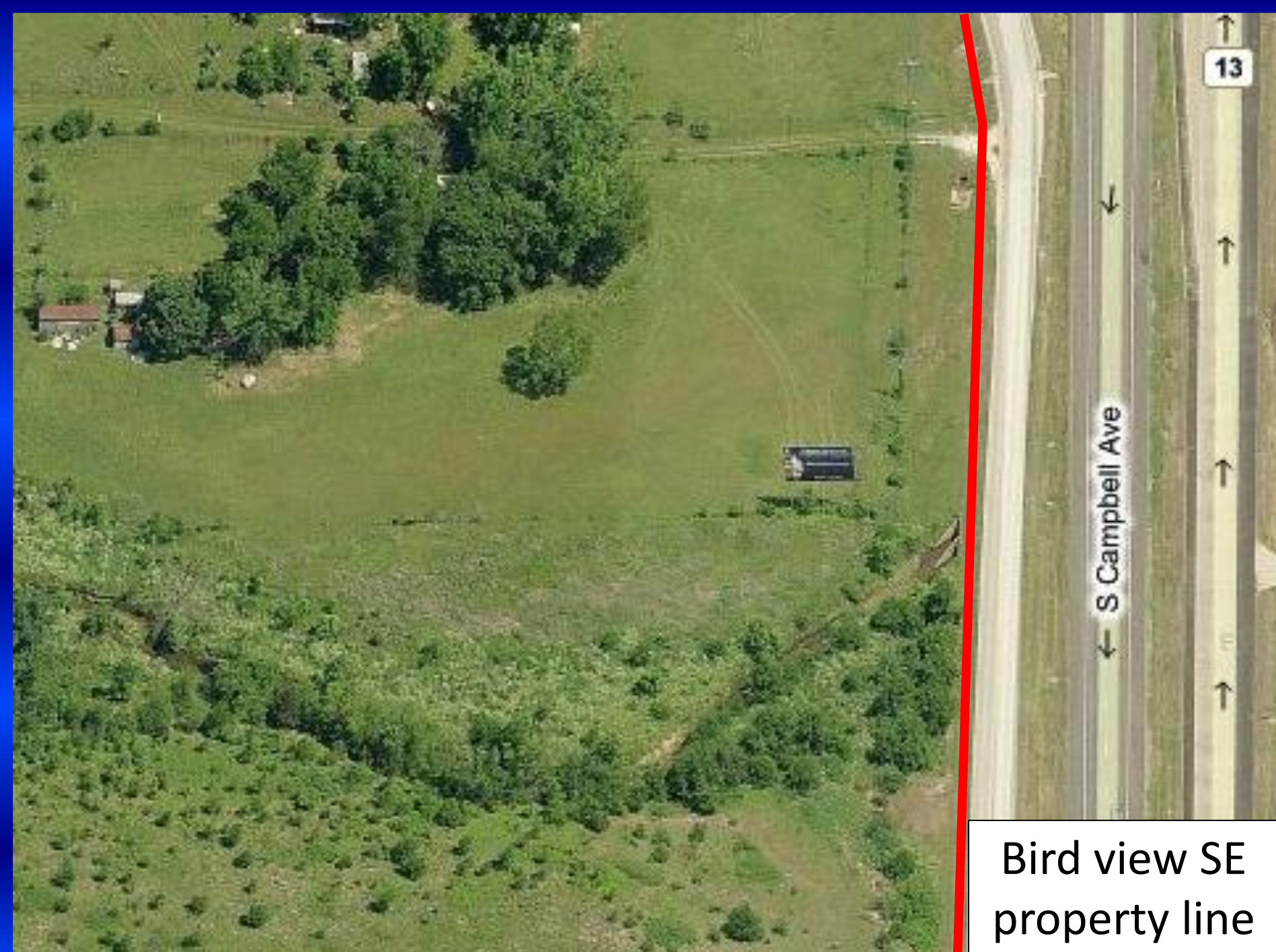
Bird view SE property line