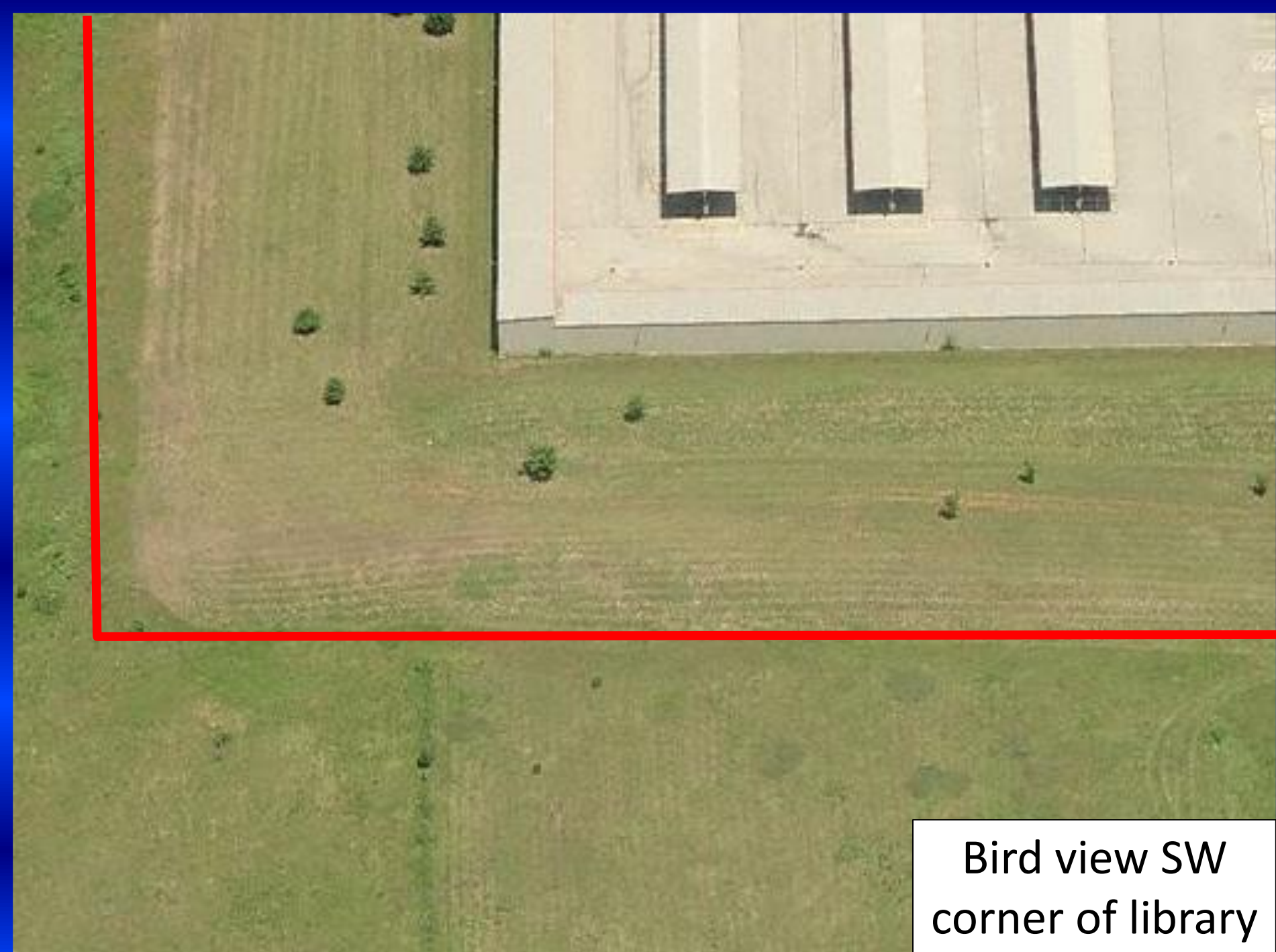
Bird view SW corner of library