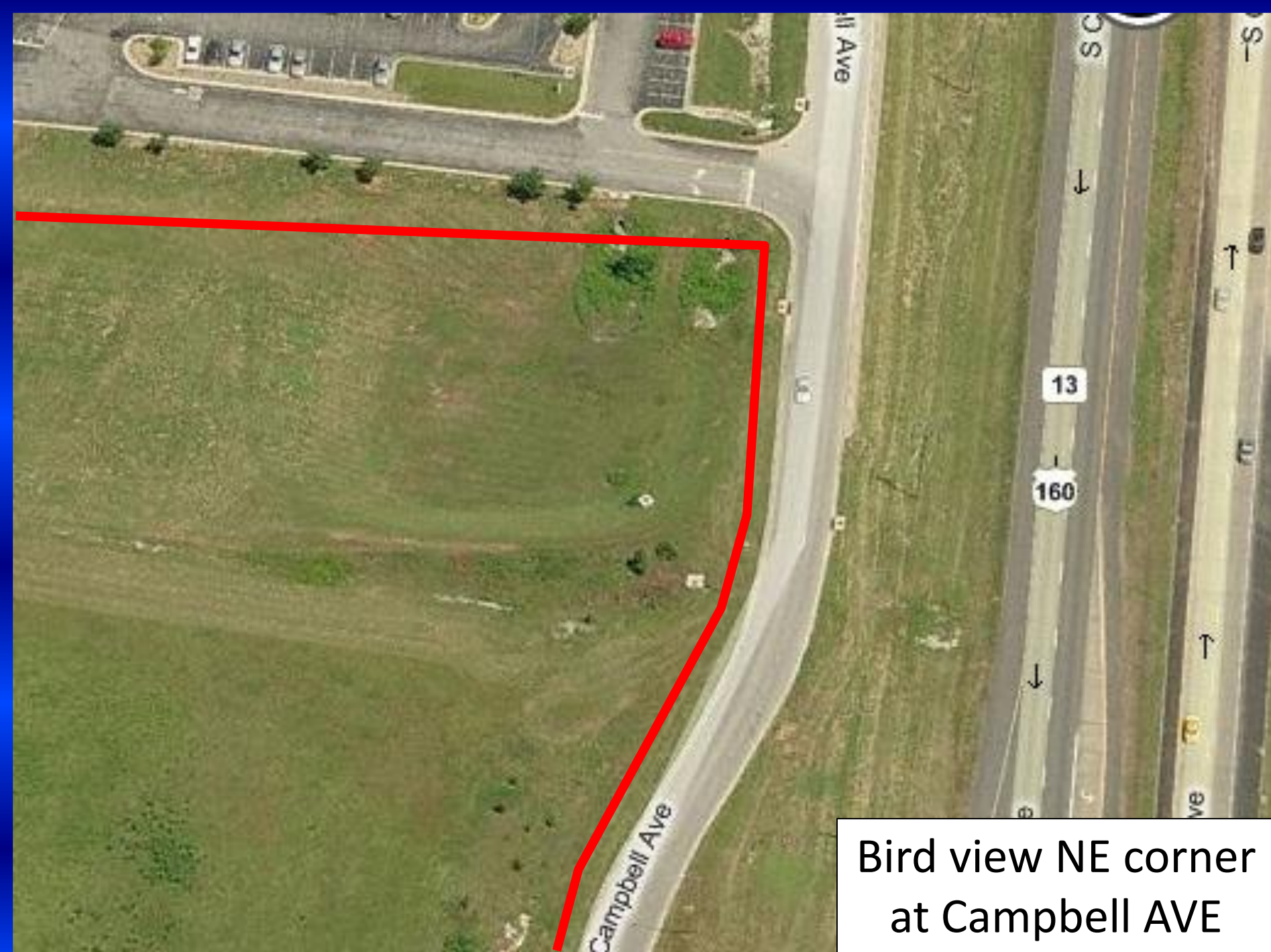
Bird view NE corner at Campbell AVE