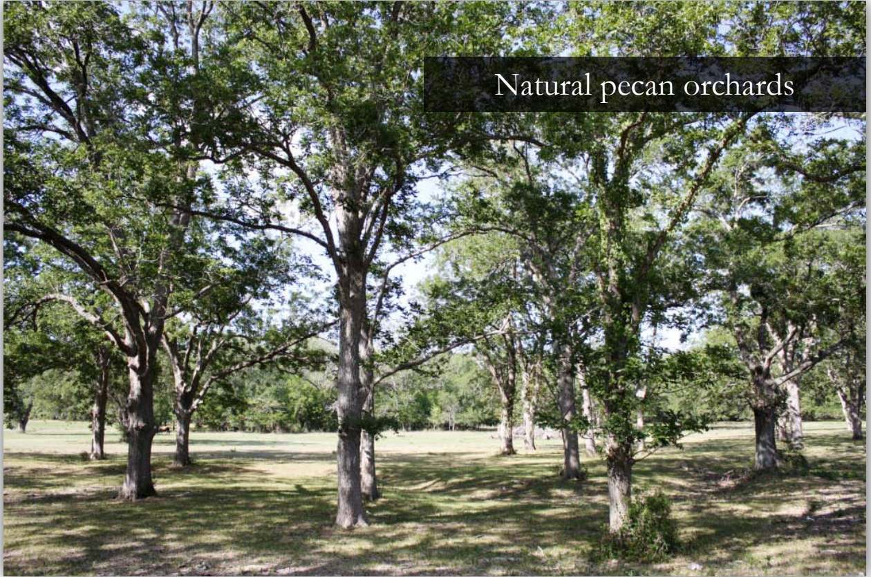
Natural pecan orchards

FOR ADDITIONAL INFORMATION ON THIS PROPERTY CALL