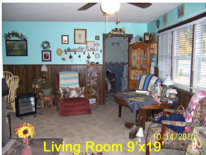
Living Room 9'x19'