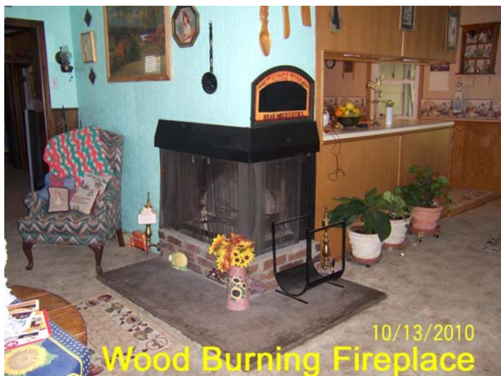
Wood Burning Fireplace