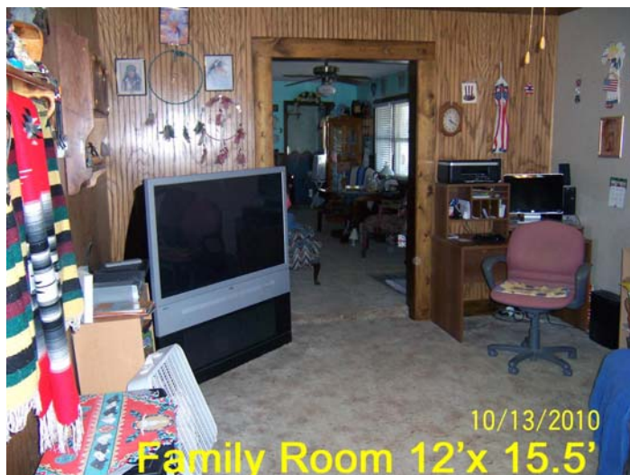
Family Room 12'x 15.5'