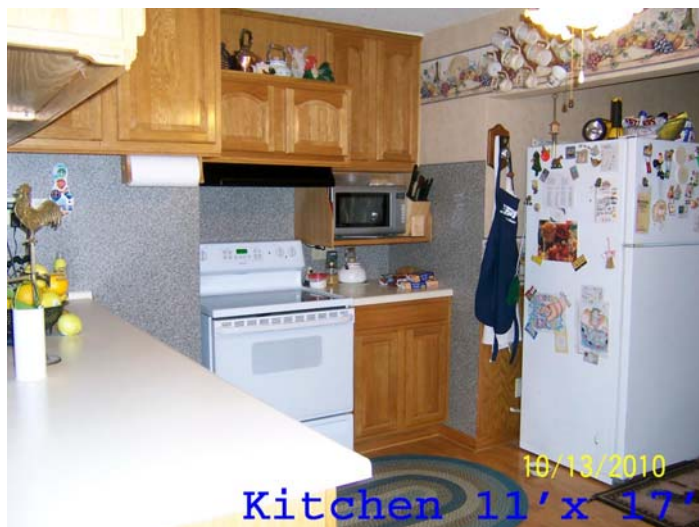
Kitchen 11'x 17'