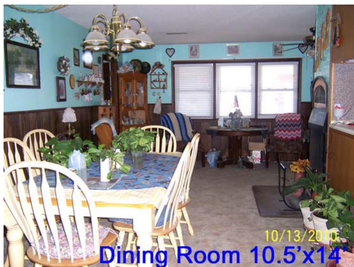
Dining Room 10.5'x14'