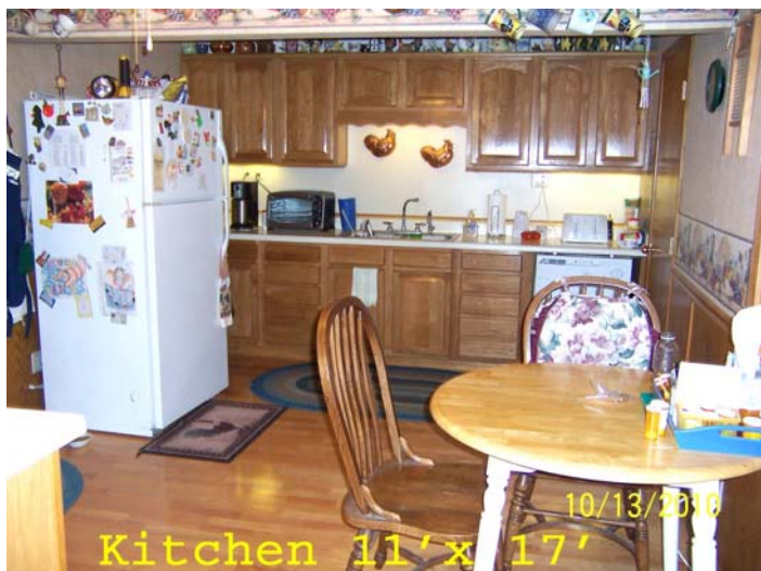
Kitchen 11'x 17'