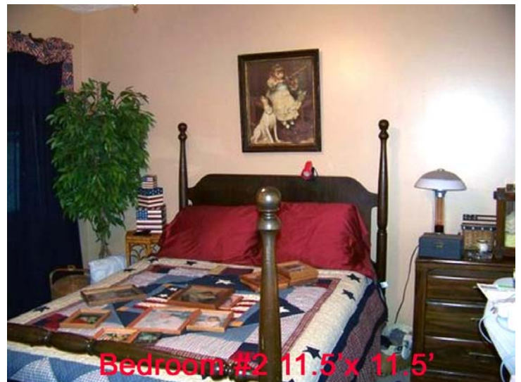
Bedroom #2 11.5'x 11.5'

This information is thought to be accurate; however it is subject to verification and no liability for errors and omissions is assumed. The listing may be withdrawn with or without approval. The seller further reserves the right to reject any and all offers. All inquiries, inspections, appointments, and offers must be sent through: Rick Barnes, BARNES REALTY COMPANY 18156 Hwy 59, MOUND CITY, MO 64470 PHONE NUMBER: 1-660-442-3177