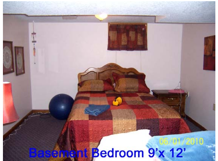
Basement Bedroom 9'x 12'