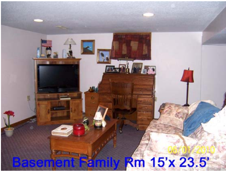
Basement Family Rm 15'x 23.5'