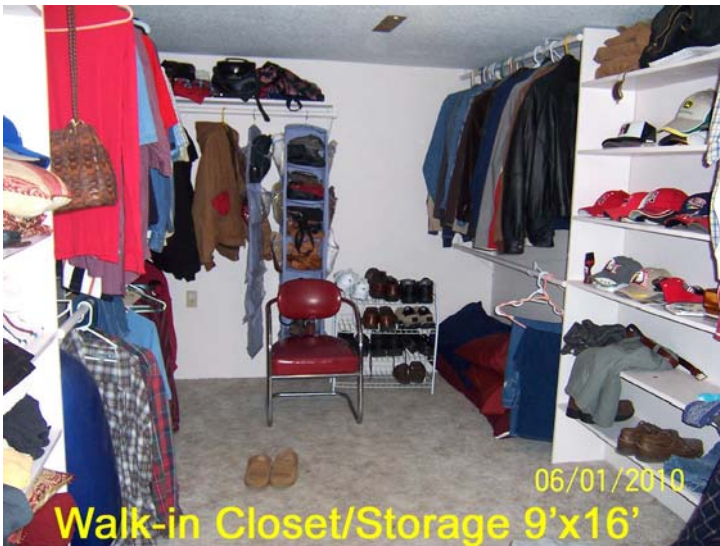
Walk-in Closet/Storage 9'x16'