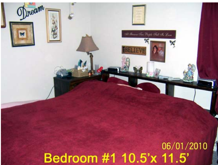
Bedroom #1 10.5'x 11.5'