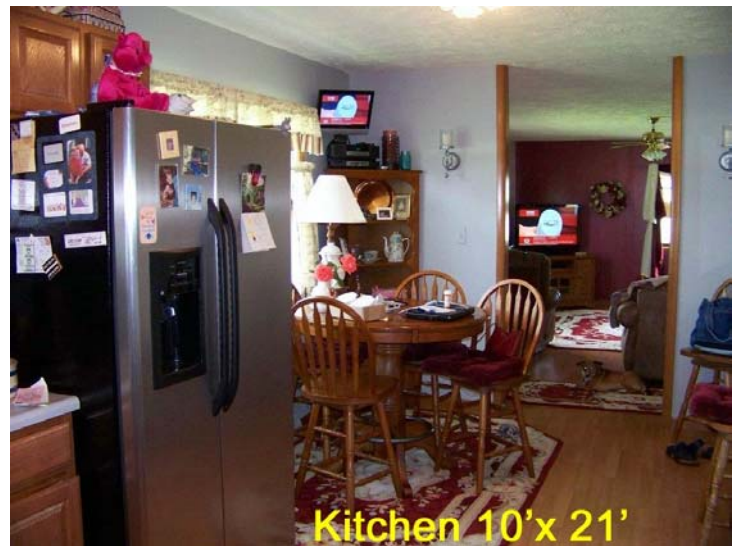
Kitchen 10'x 21'