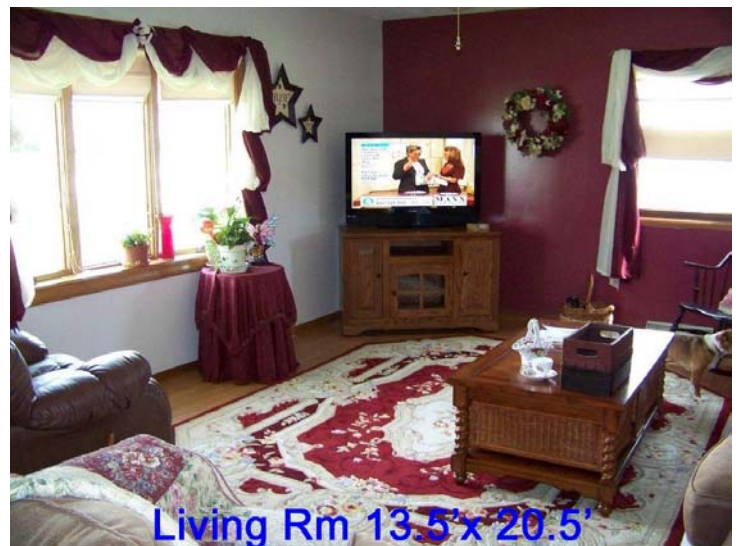
Living Rm 13.5'x 20.5'