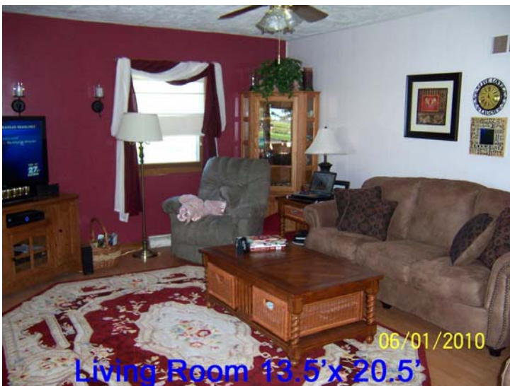
Living Room 13.5'x 20.5'