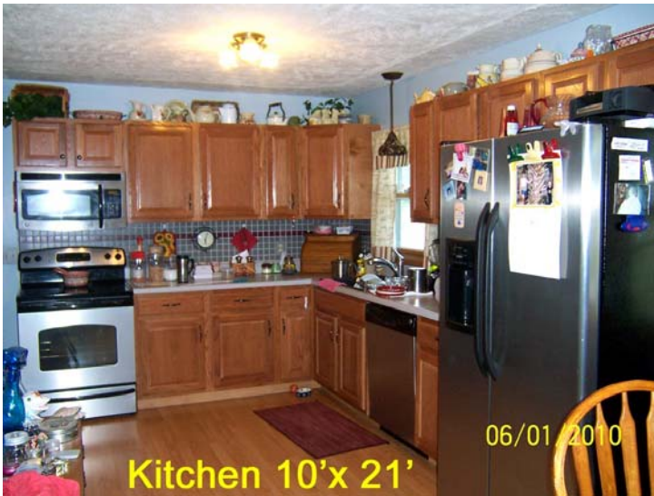
Kitchen 10'x 21'