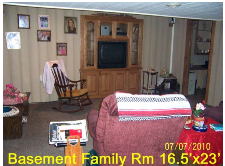
Basement Family Rm 16.5'x23'