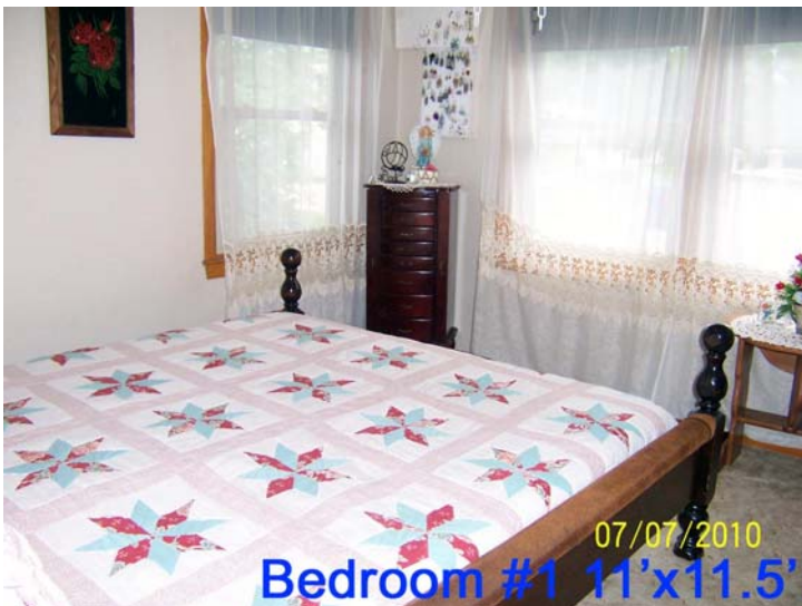
Bedroom #1 11'x11.5'