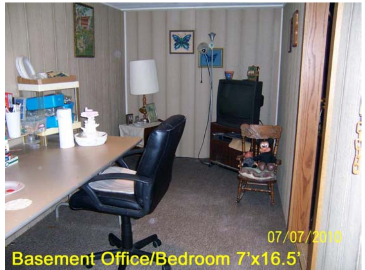
Basement Office/Bedroom 7'x16.5'