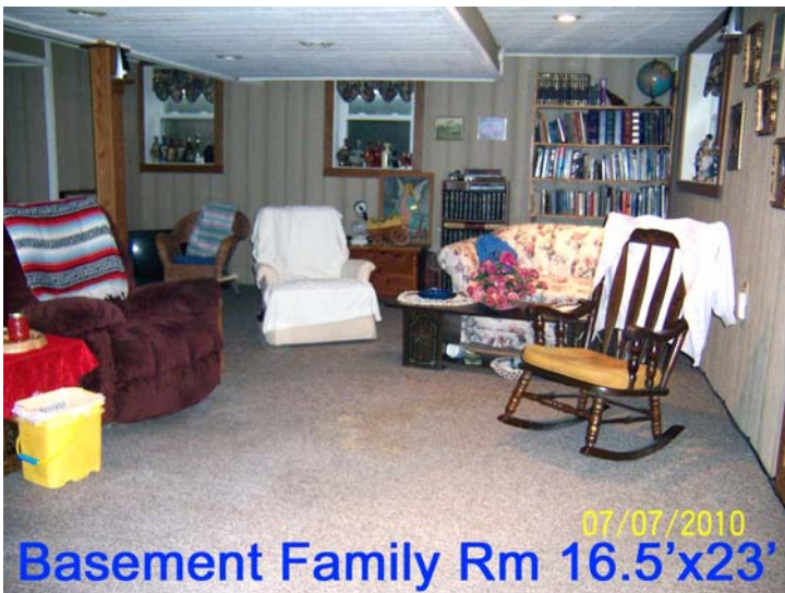
Basement Family Rm 16.5'x23'