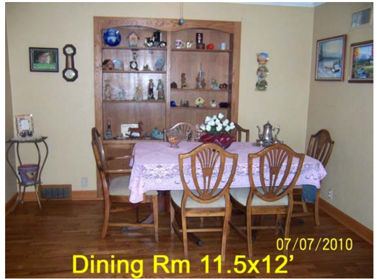
Dining Rm 11.5x12'