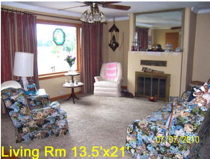
Living Rm 13.5'x21'