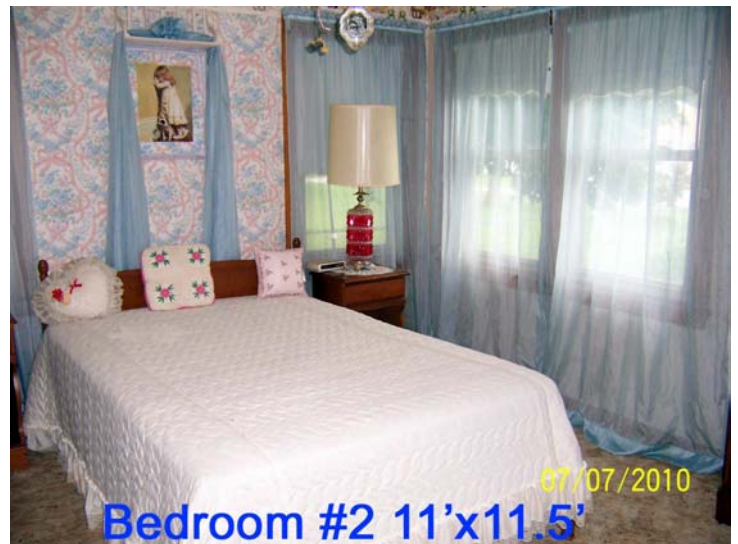
Bedroom #2 11'x11.5'

This information is thought to be accurate; however it is subject to verification and no liability for errors and omissions is assumed. The listing may be withdrawn with or without approval. The seller further reserves the right to reject any and all offers. All inquiries, inspections, appointments, and offers must be sent through: Rick Barnes, BARNES REALTY COMPANY 18156 Hwy 59, MOUND CITY, MO 64470 PHONE NUMBER: 1-660-442-3177