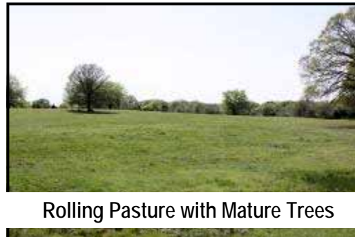
Rolling Pasture with Mature Trees