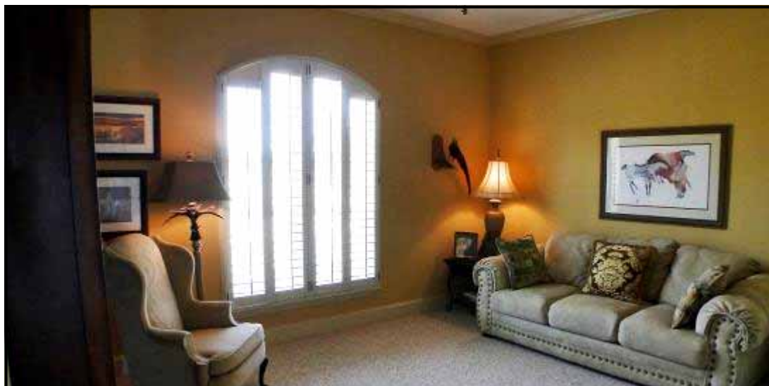
1st Bedroom with Elegant Private Bathroom