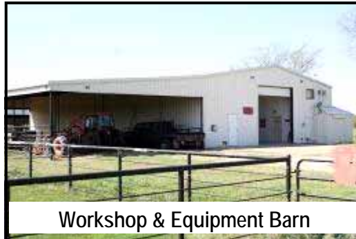
Workshop & Equipment Barn