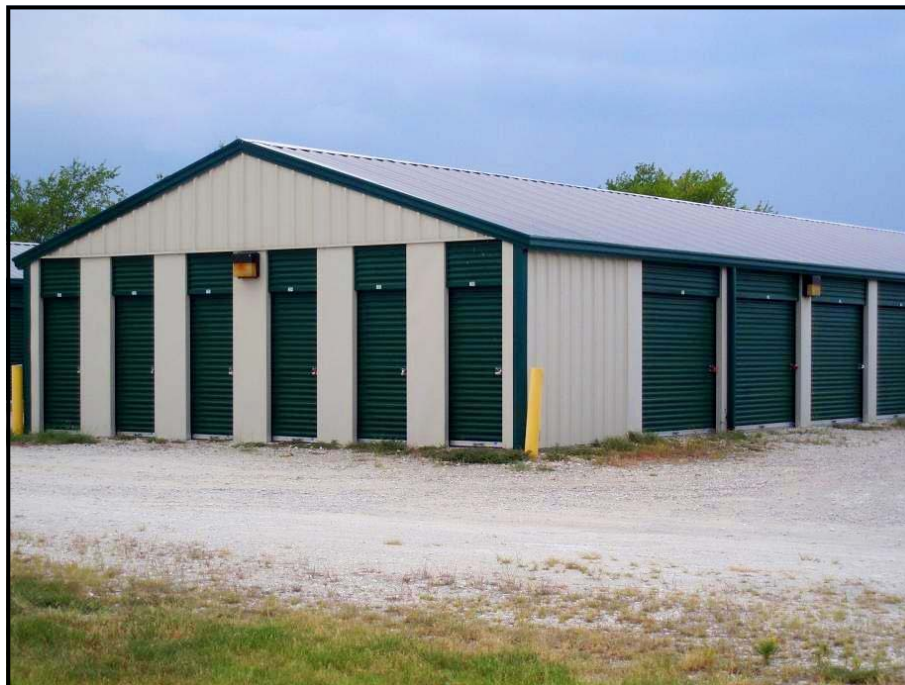
59 attractive storage units of varying sizes