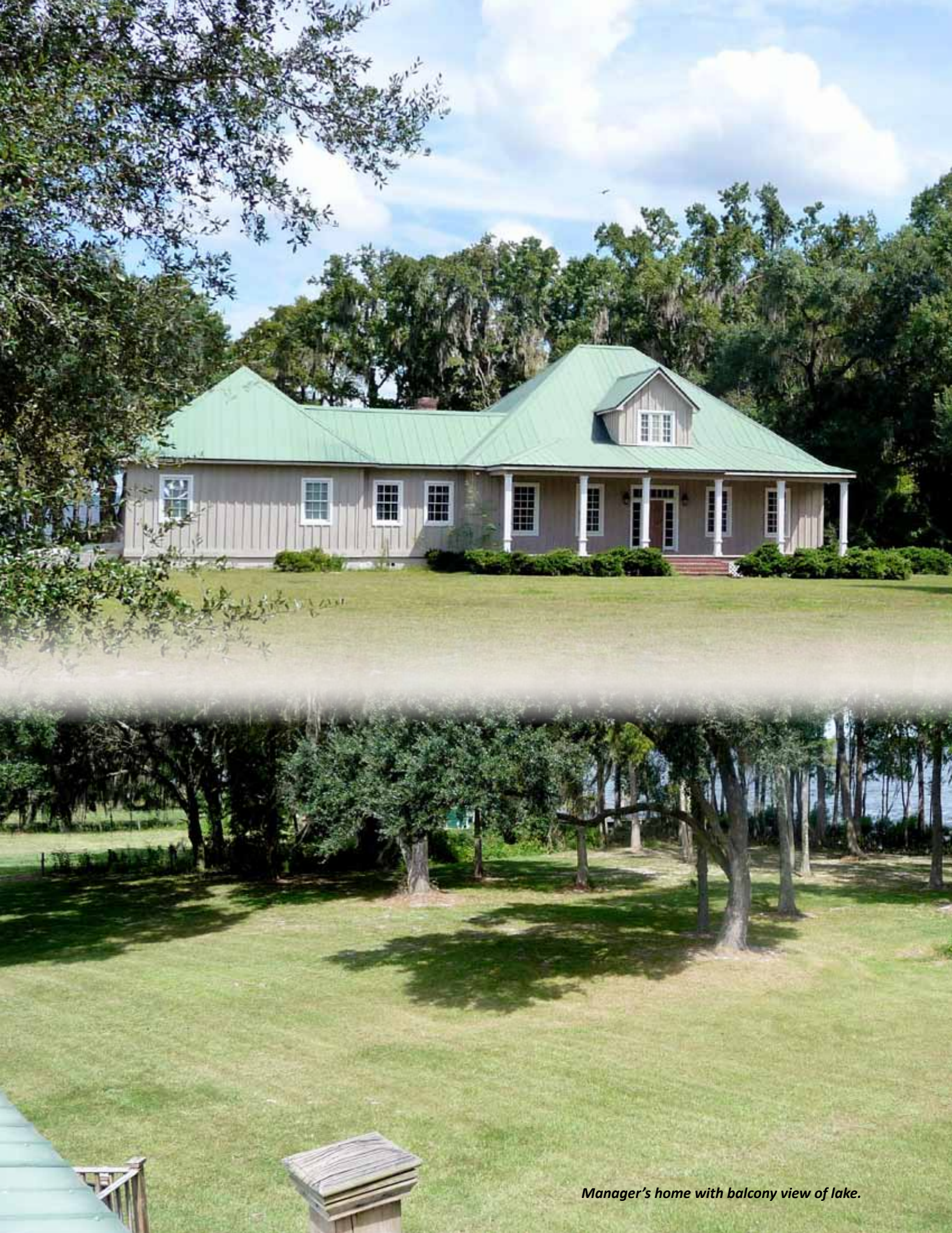
Manager's home with balcony view of lake.