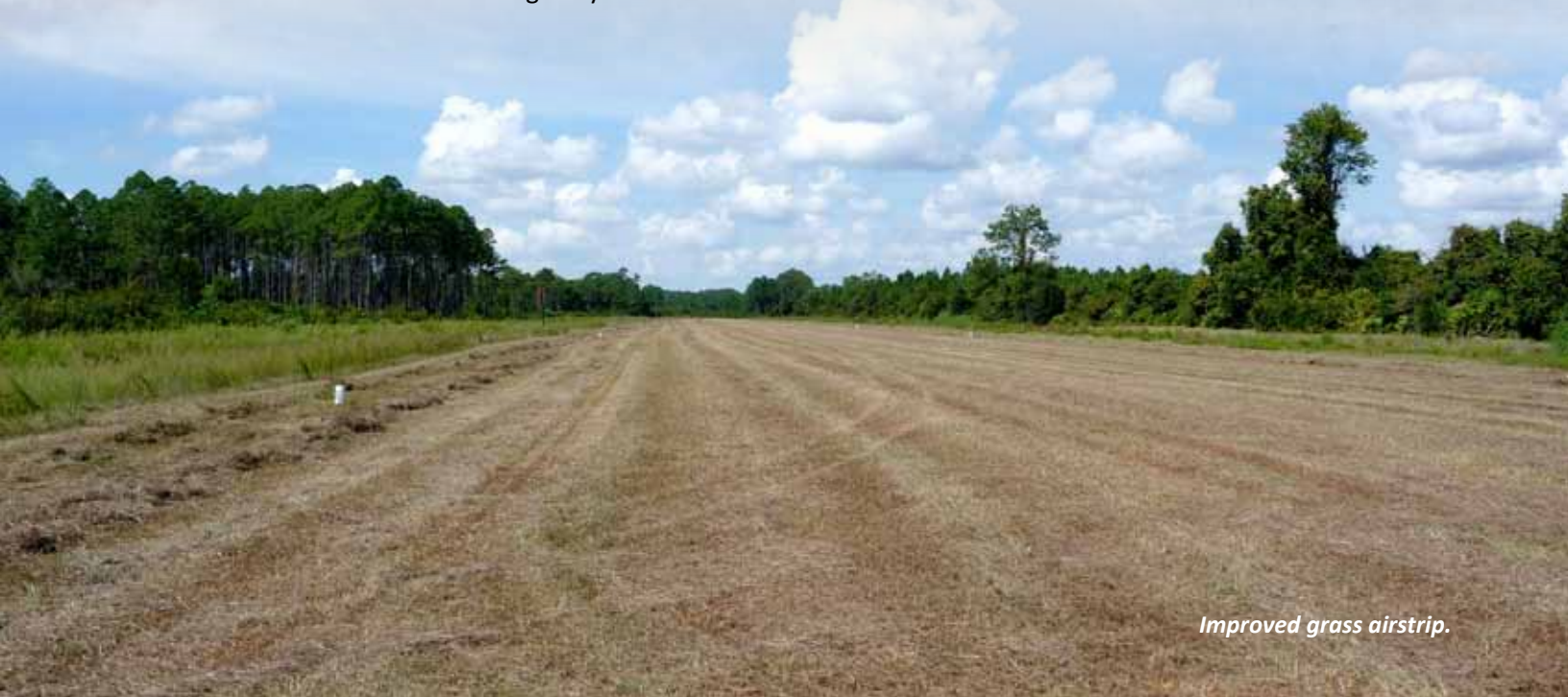
Improved grass airstrip.

Crescent Lake is part of the St. Johns River waterway that flows to Jacksonville and into the Atlantic Ocean. You could go anywhere in the world!