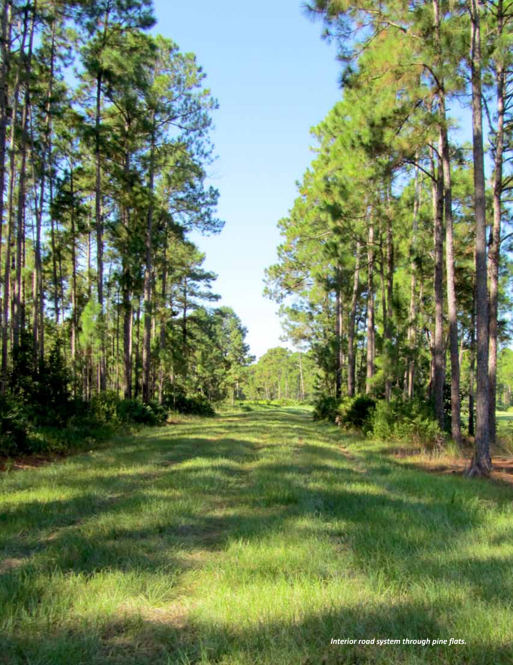
Interior road system through pine flats.