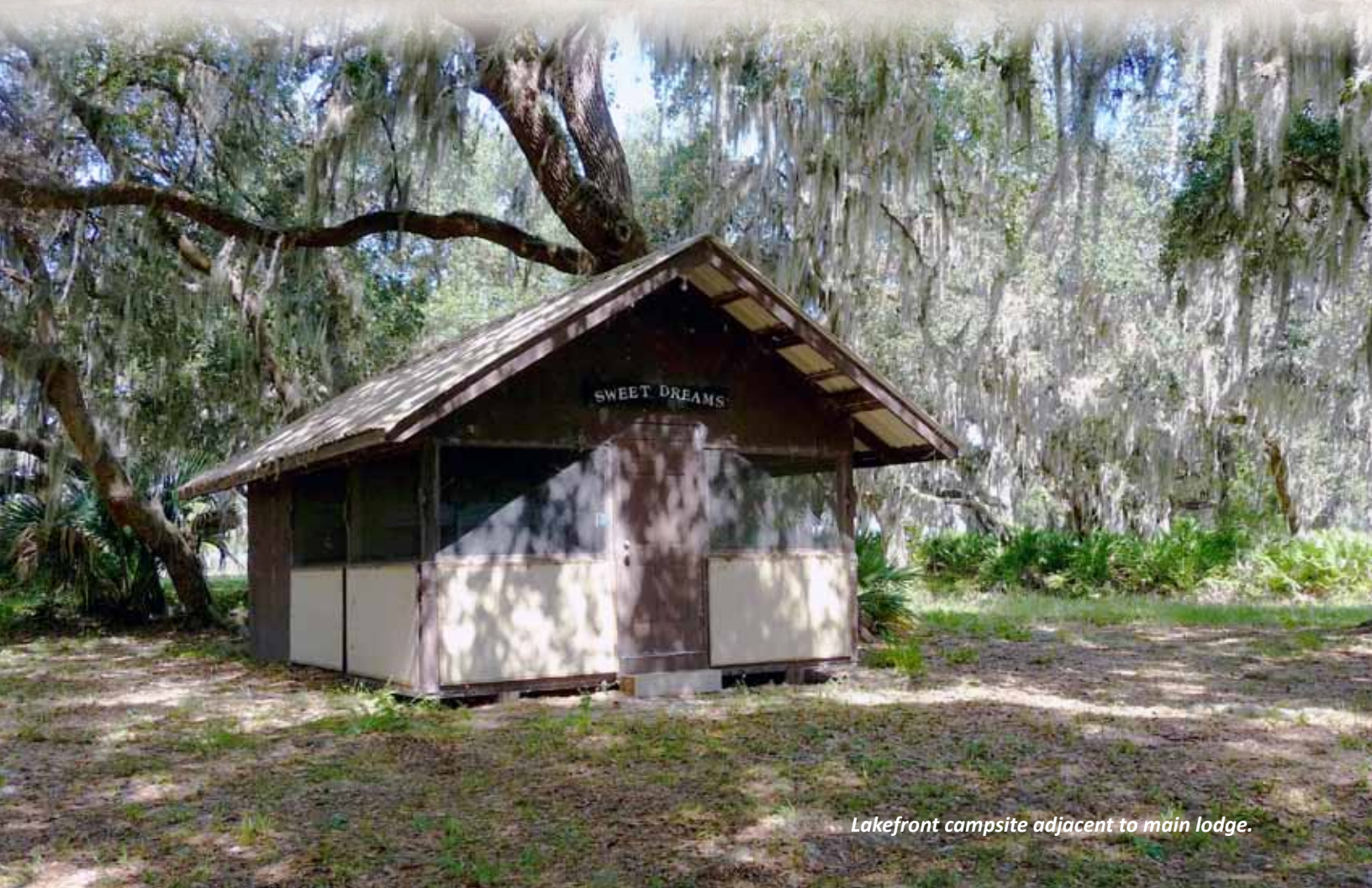
Lakefront campsite adjacent to main lodge.