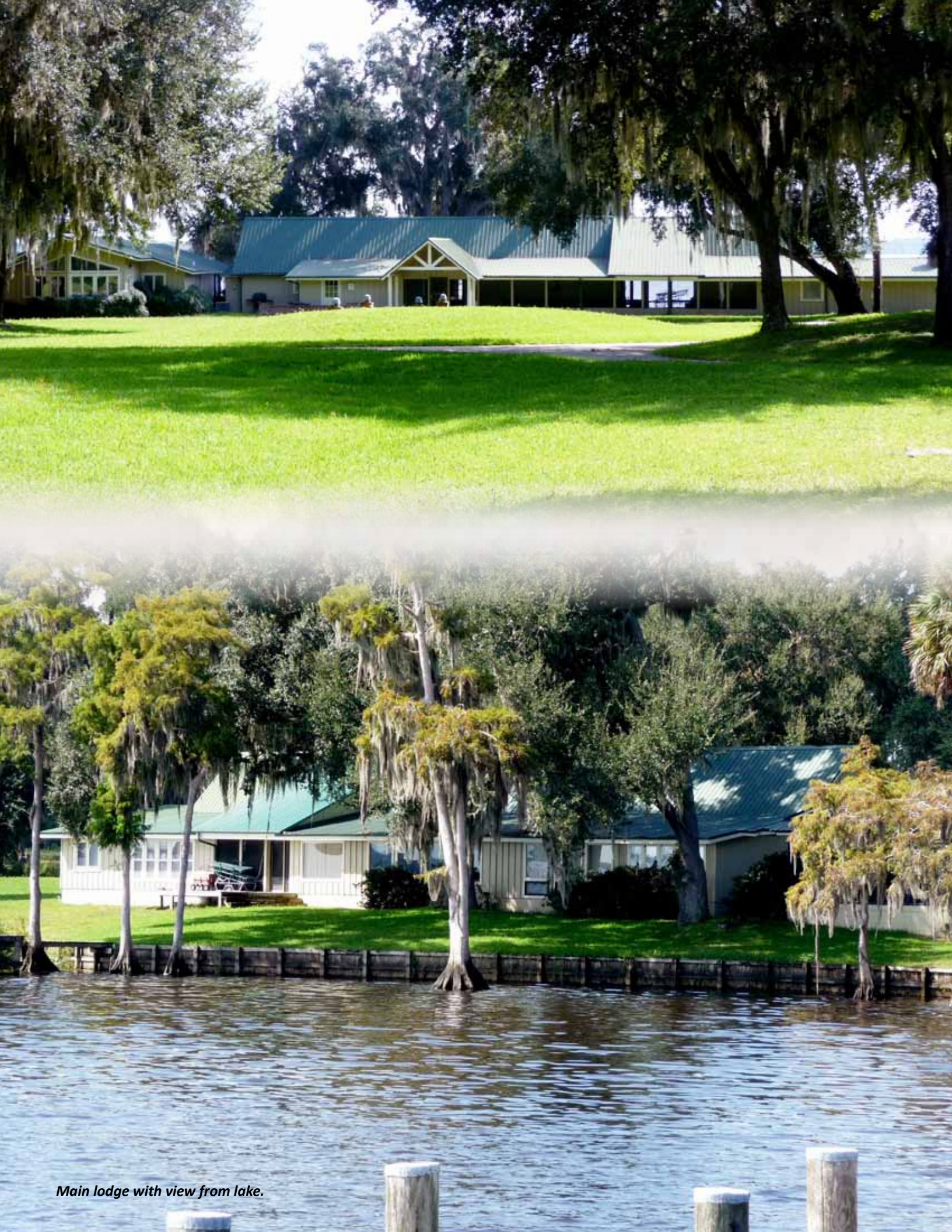
Main lodge with view from lake.