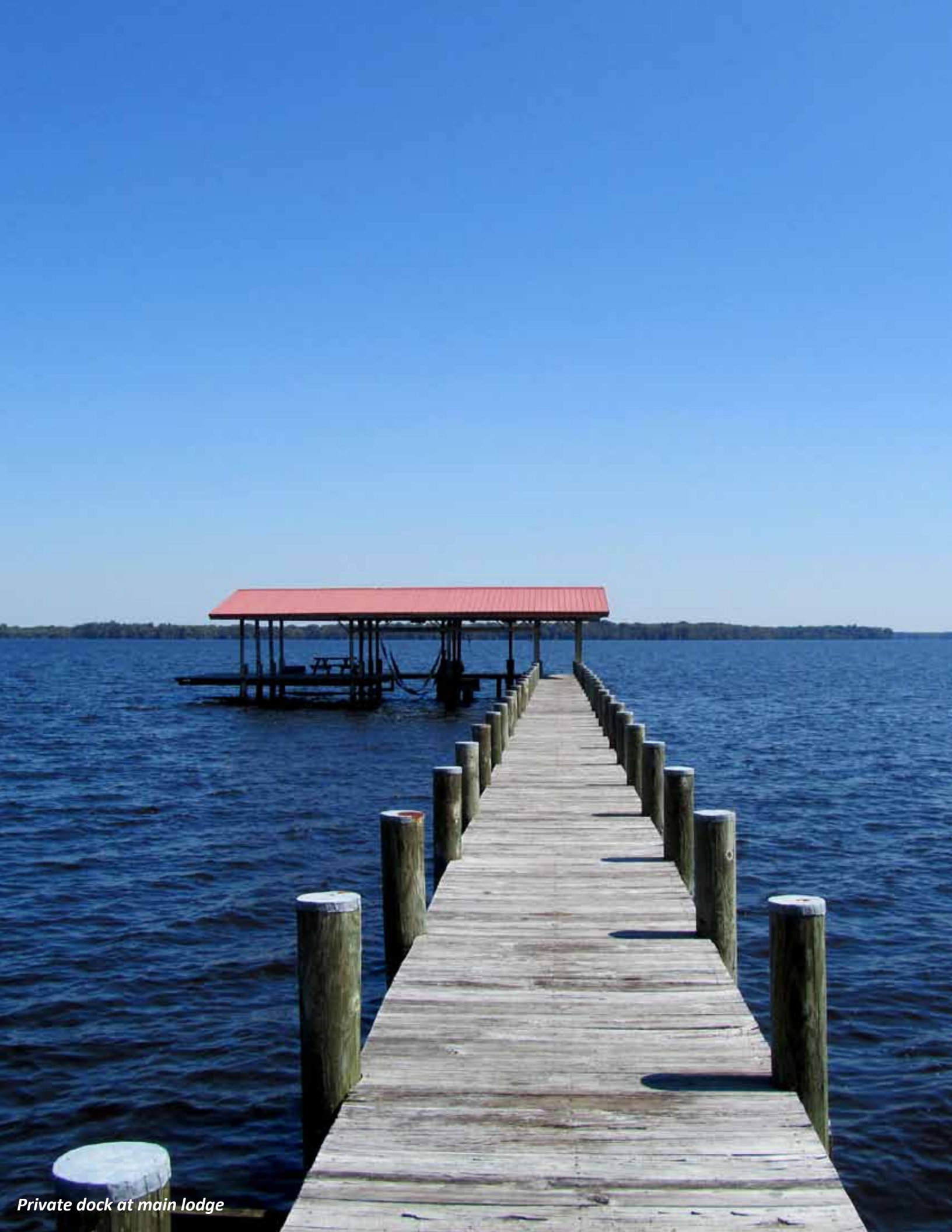
Private dock at main lodge