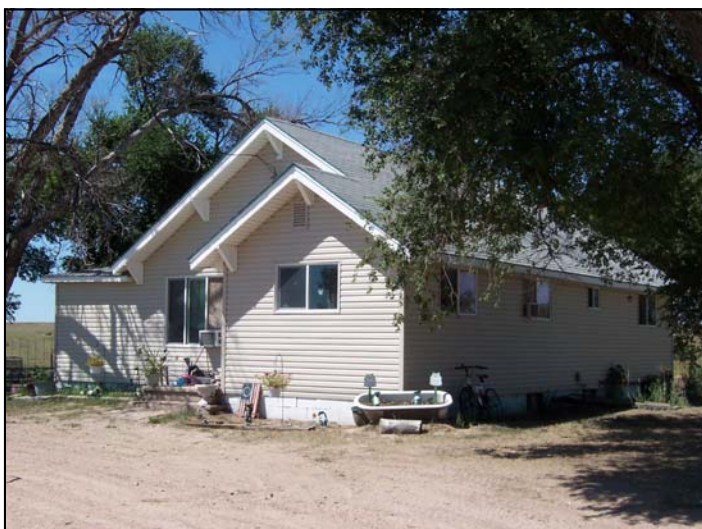
1,144 sf Ranch House 3 Bedroom, 1 Bath