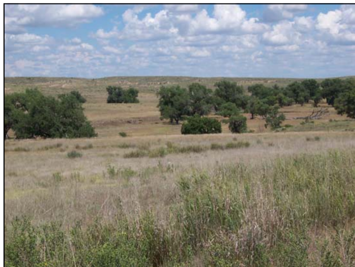
Bottom Grass and Trees Great Turkey and Deer Habitat