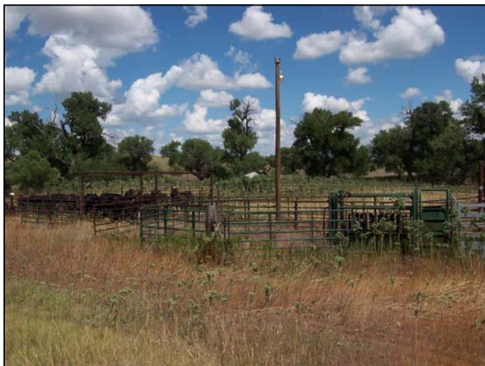
Nice Steel Corrals for Working Cattle or Loading Out