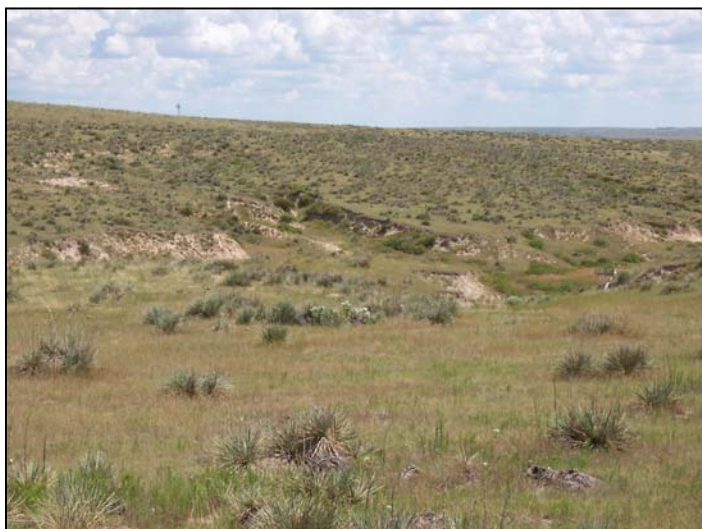
Scenic Hard-land Grass