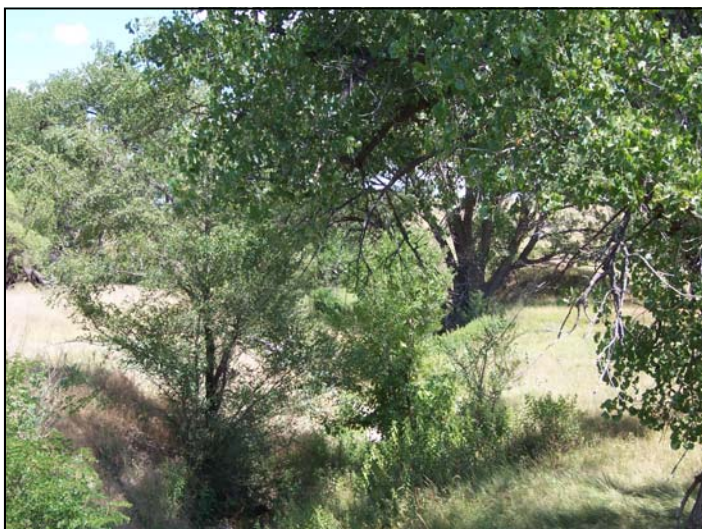
Live Water & Creek-bottom Grass