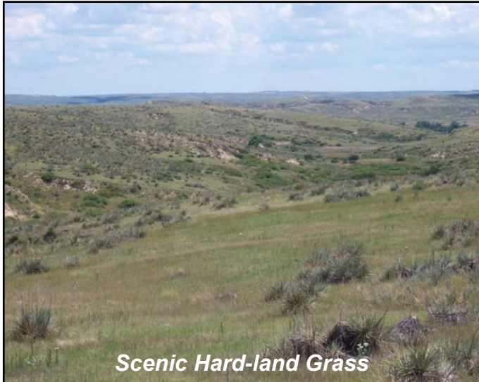
Scenic Hard-land Grass