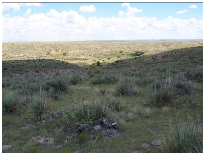
Hills and Valleys With Springs and Wildlife