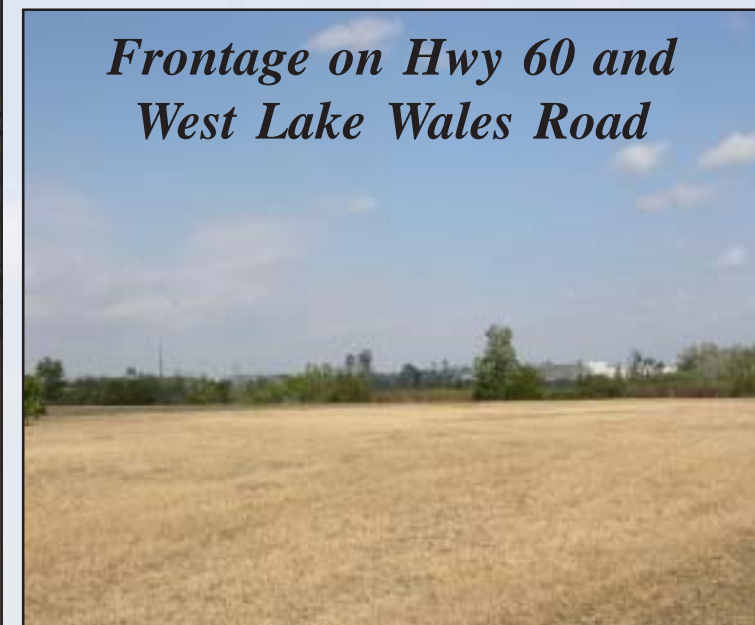
Frontage on Hwy 60 and West Lake Wales Road