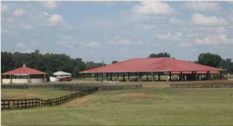
Circle Pen and Arena

Total Acreage: 38.92 +/- acres Price: $1,250,000 NEW PRICE: $875,000 January 2011 Address: 2414 SE 25th Loop Summerfield, FL 34491 Land Use: A-3 (Residential Agriculture Estate Marion County) Water/Utilities: Well, septic, SECO Riding Arena: 16,500 SF (covered) Dressage Ring: 10,450 SF Circle Pen: 2,400 SF Clubhouse: 1,500 SF