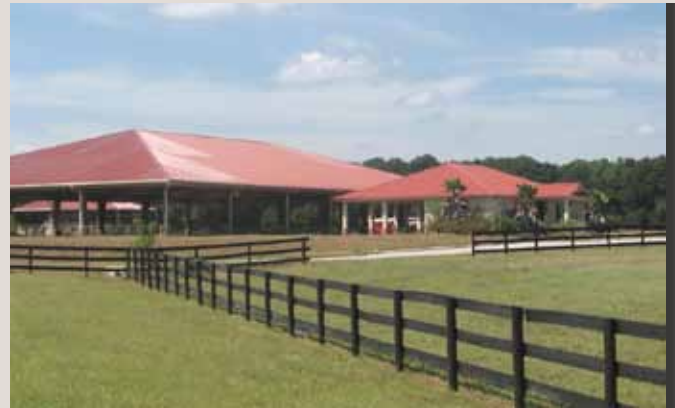
Clubhouse with Kitchen & Bathrooms

The equestrian themed subdivision, 38.92 +/- acres, is platted and developed as 8 single family lots.