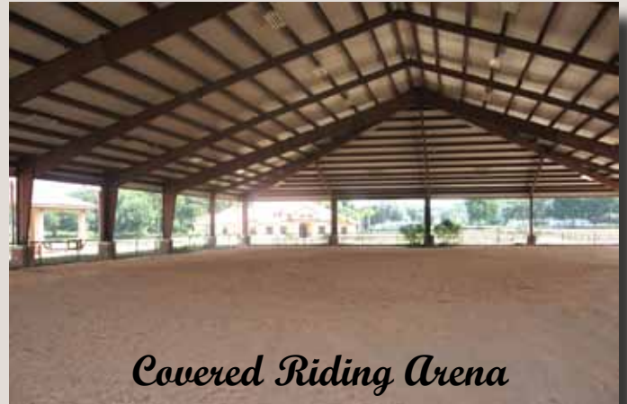
Covered Riding Arena

The entire property is fenced, gated, with beautiful riding trails.