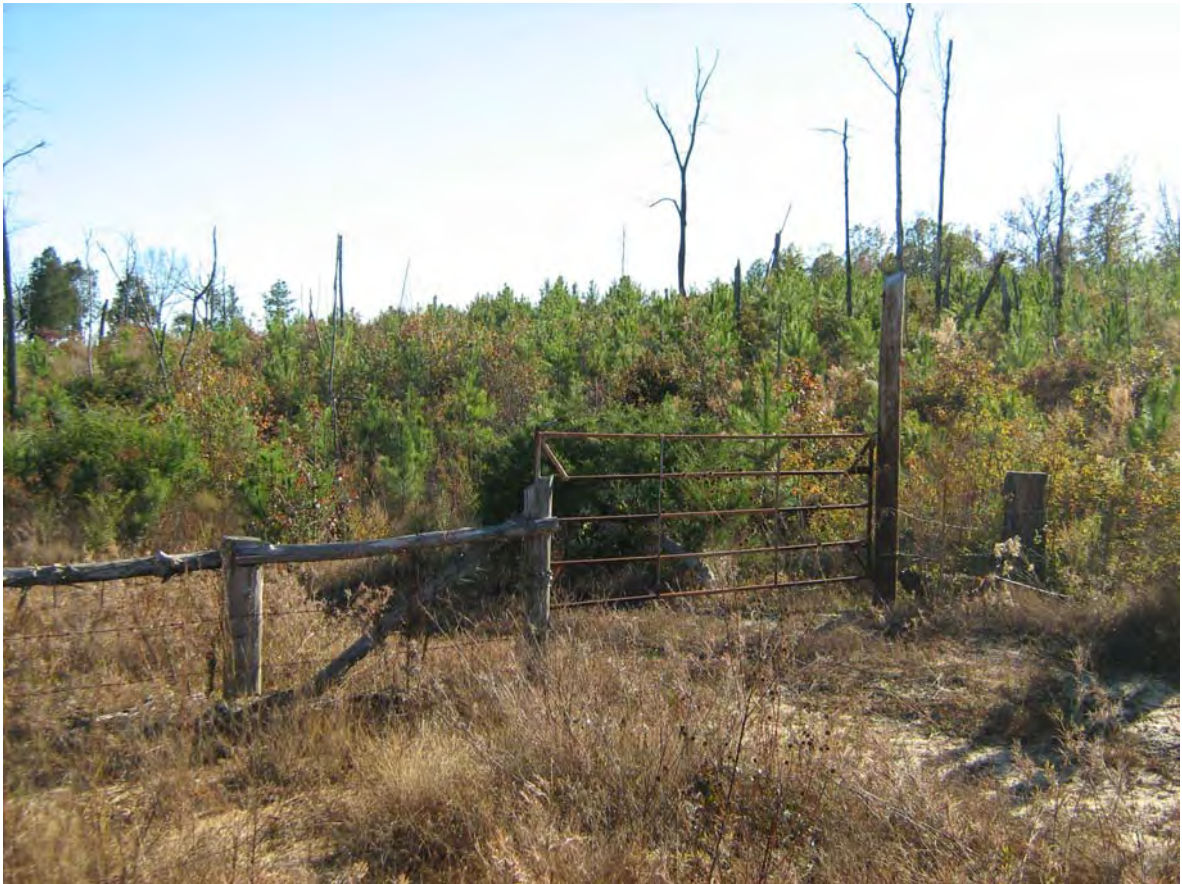
Entrance to Tract 'A'