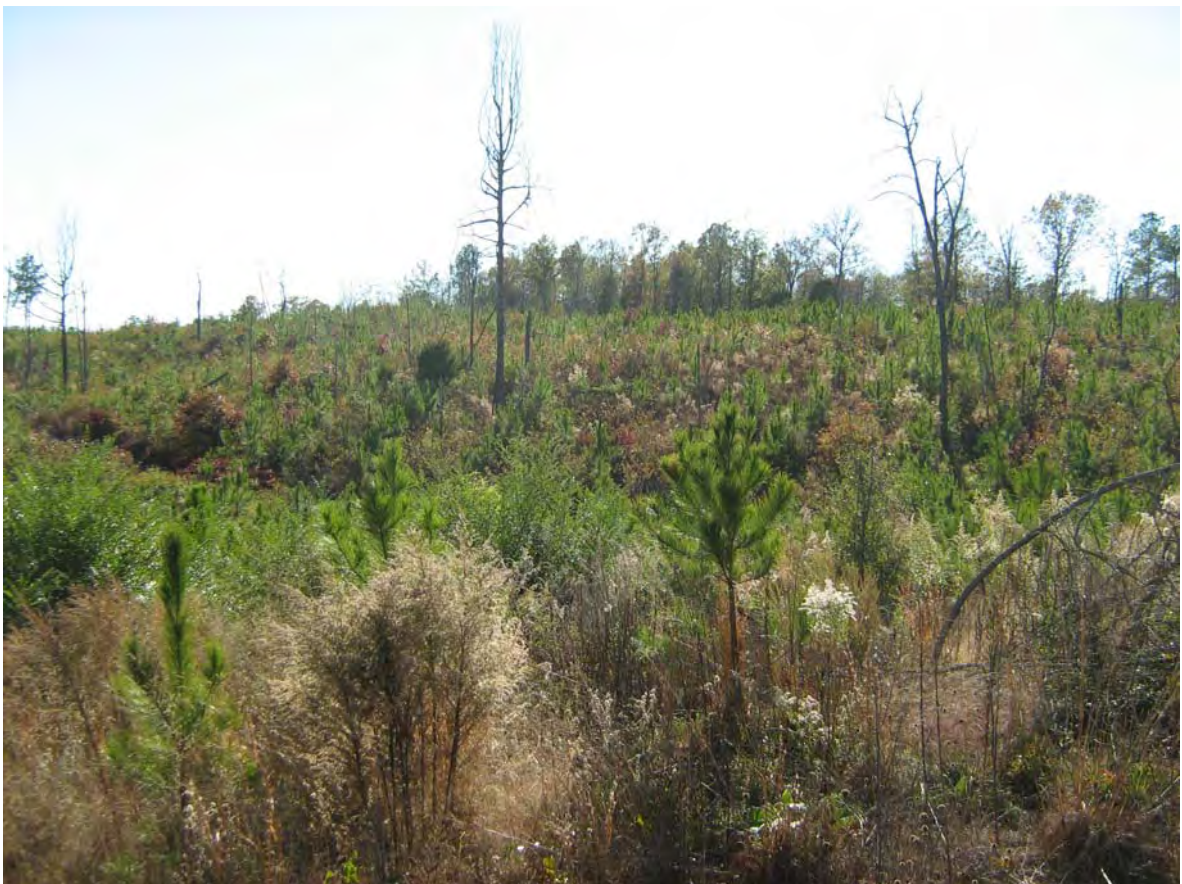
25 ac of three year old pines on Tract 'A'