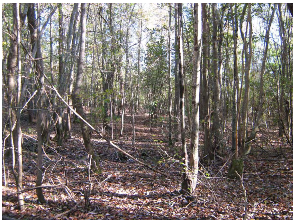
bottomland hardwood on south end of Tract 'A'