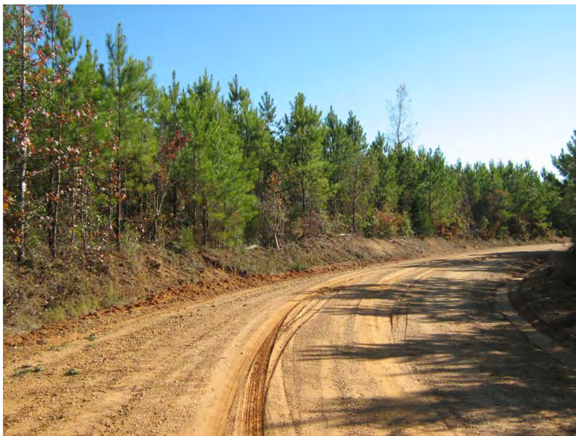
Frontage on Steedley Rd and 60 ac of 8 yr old pines on Tract 'B'