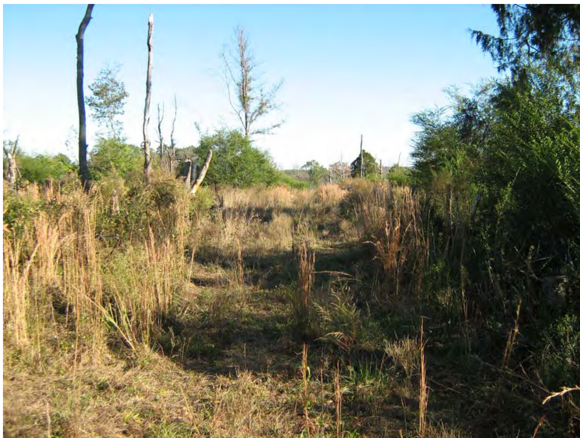
another woods road