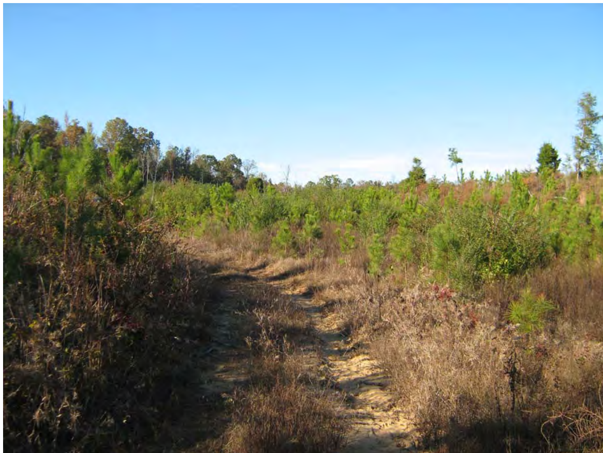
woods road on Tract 'A'