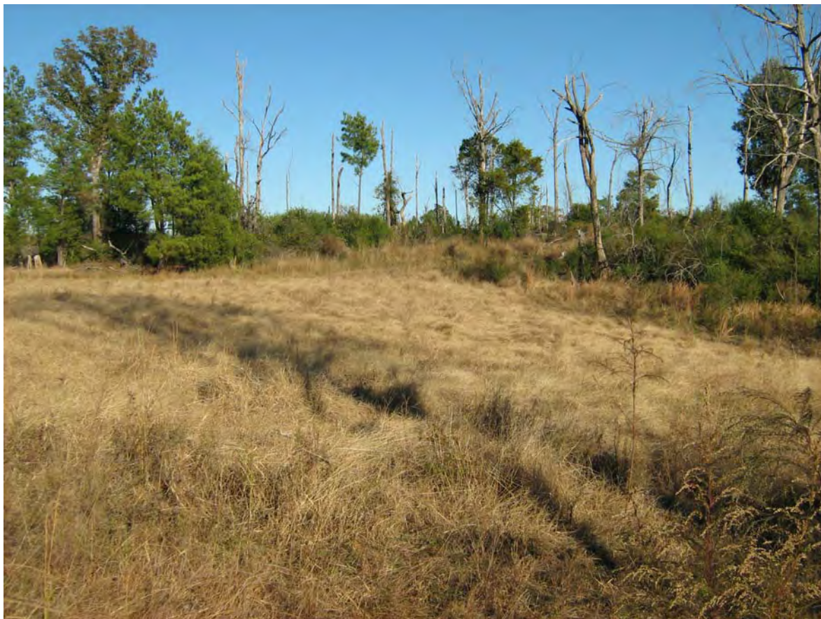
One of 3 green-fields on Tract 'A'