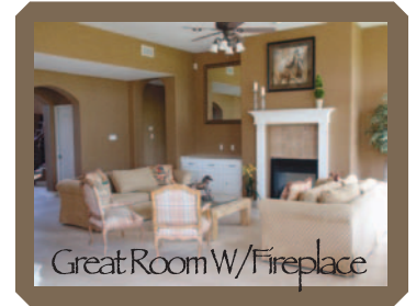
Great Room W/ Fireplace