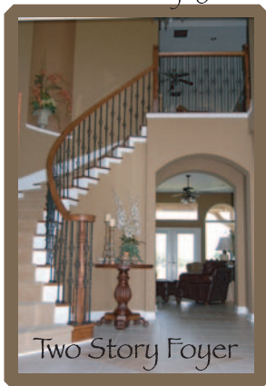
Two Story Foyer

Private gated community 45 minutes from downtown Houston. Your horses will enjoy 10 acres of improved pastures, fenced and cross fenced, pond and barn. The custom built home welcomes you with a dramatic foyer and graceful staircase. Enjoy the views through the french doors of the great room.