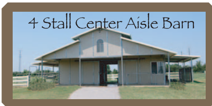
4 Stall Center Aisle Barn