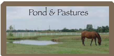
Pond & Pastures