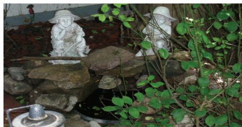
Small Pond back patio