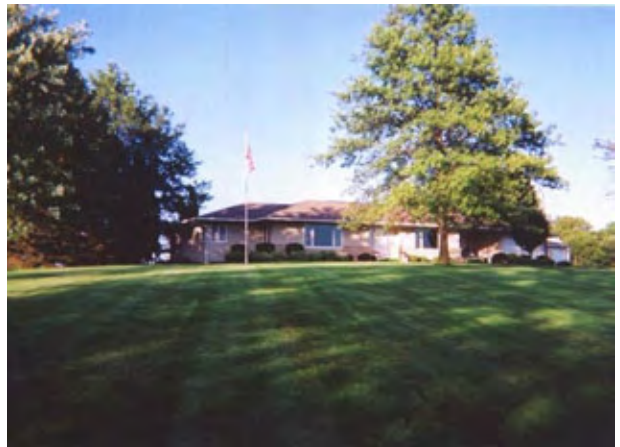
House & Yard