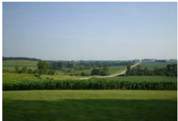
View to the Northwest