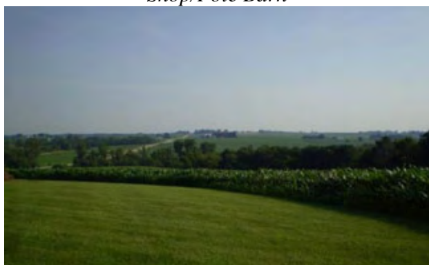
View to the North