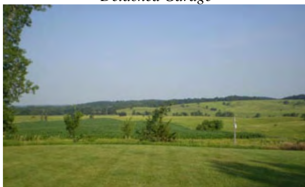
View to the West