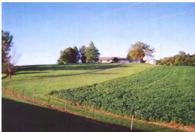
House & Yard